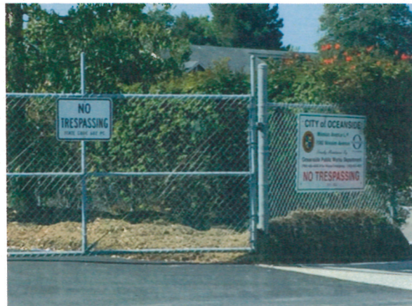
Photograph 3: Landfill signage.