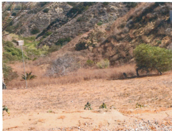
Photograph 2: Landfill face, and owl box