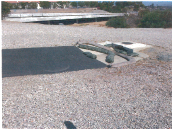
Photograph 1: Storm Water BMPs.