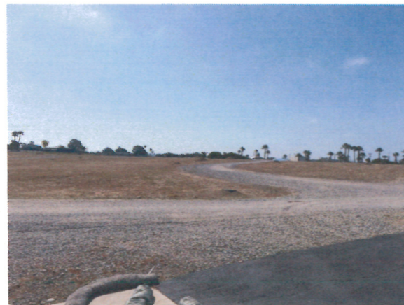
Photograph 4: Landfill cover.