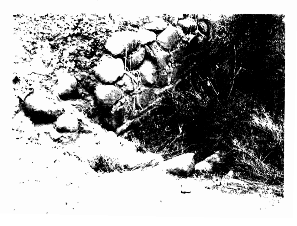
Figure 3. Outlet (above) and inlet (below) 12/26/07