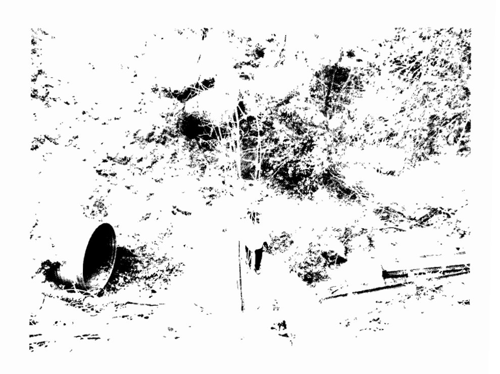
California Department of Transportation 11-SD-78, PM 31.7 Remove and Replace Corrugated Metal Pipe