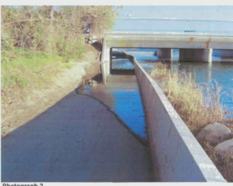
Photograph 2 San Juan Bike Trail, within the project site, looking north at PCH.