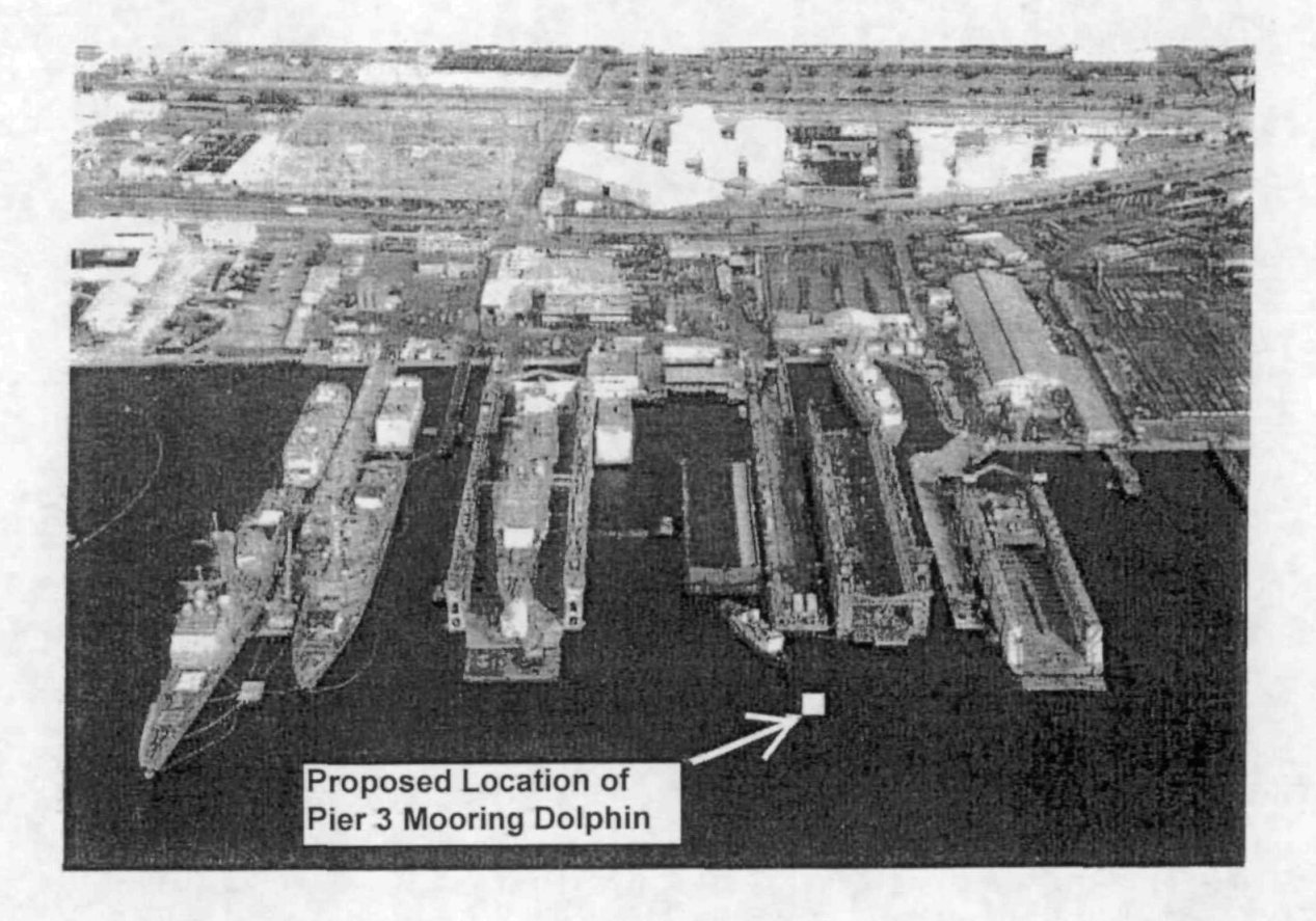
Figure 5 – Aerial facility photo showing location of proposed mooring dolphin. Project: BAE Systems Pier 3 Dolphin Applicant: BAE Systems San Diego Ship Repair Inc. (SDSR) Type of Illustration: Vicinity Map