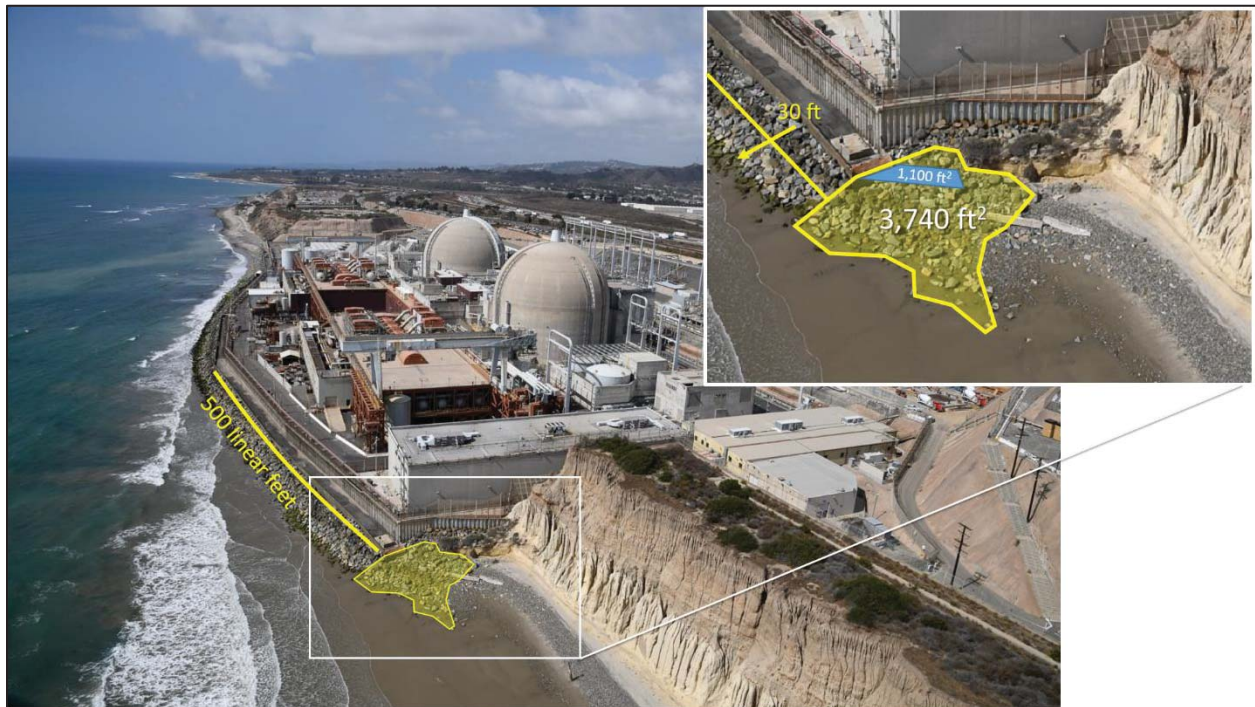
Figure 3. September 2017 aerial photograph showing the linear area along the beach walkway revetment wall that will be supplemented with imported riprap. The irregular polygon on the walkway's southernmost end is the area of proposed riprap placement. The project team will place riprap within the boundary of this polygon that totals approximately 3,740 ft 2 . The entire polygon may not be filled with riprap.