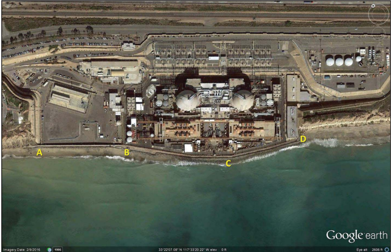
Figure 2. The public beach walkway is situated along the west (seaward) perimeter of San Onofre Nuclear Generating Station, sections of which are denoted by letters A through D. The North Industrial Area walkway comprises sections A (north entrance of walkway) to B. Section B marks the beginning of the Units 2/3 walkway and ends at D. The length between sections C to D is the area of highest need of riprap repair.