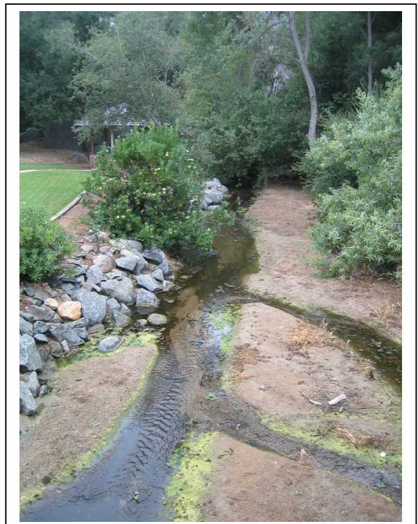
Green Valley creek (HSA 5.22) at Orchard Bend crossing on July 5, 2005 at 0819 hrs.