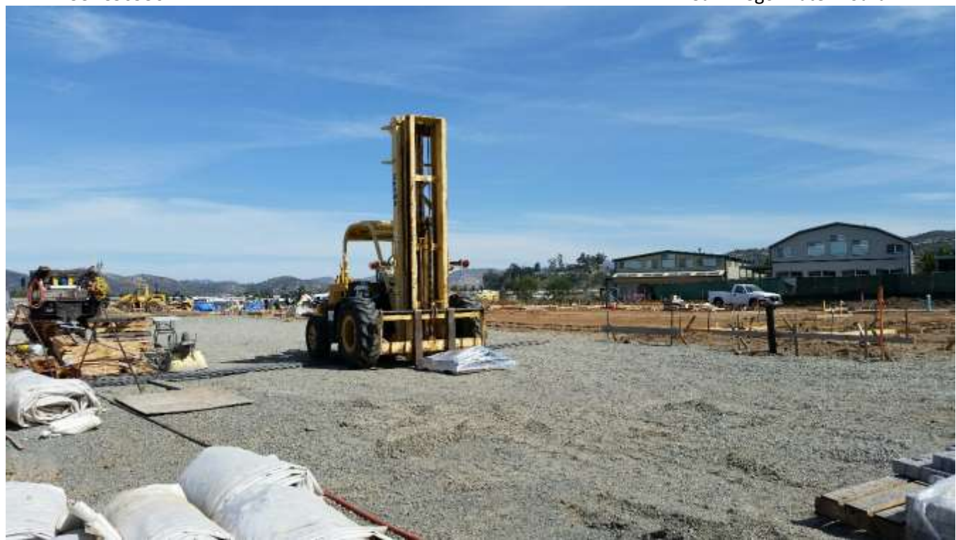
Below: Improperly installed silt fence. Loose sediment/soil/DG – needs to be stabilized (erosion controls).