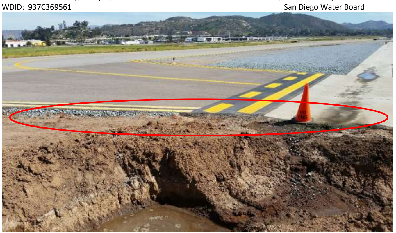
Lack of perimeter controls. Improperly installed silt fence.