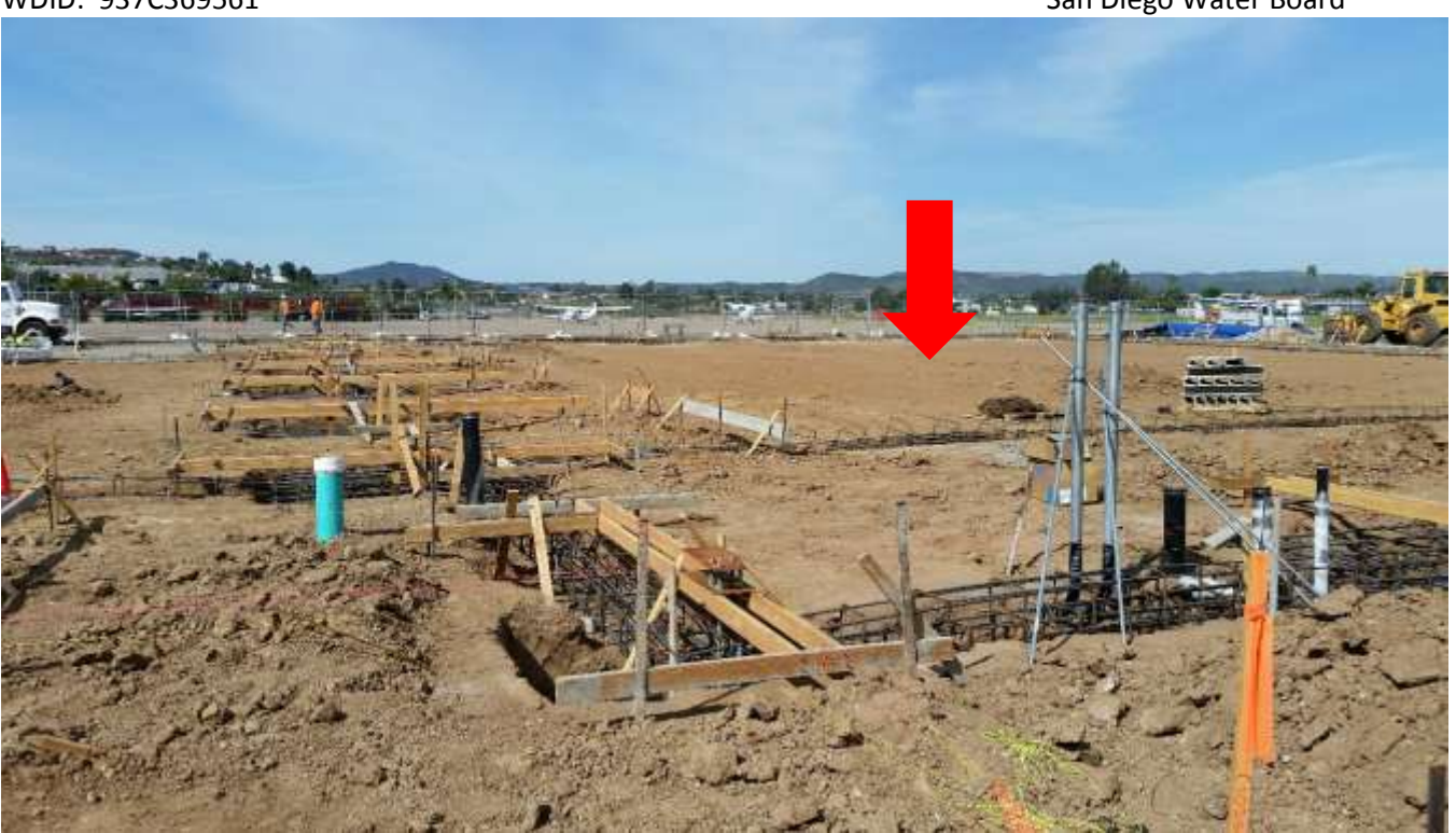
Inactive areas/completed pads should be stabilized (erosion control BMPs)