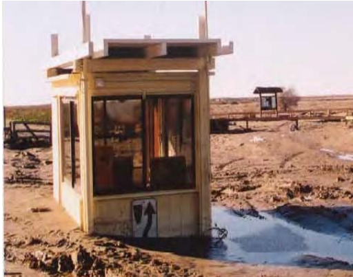
Storm events have caused up to several feet of sediment to deposit in the Tijuana River Valley.