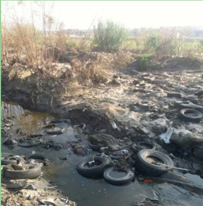
Tijuana River Estuary is designated as wetlands of international importance.