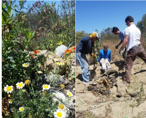
The Tijuana River Valley is a unique resource with valuable salt marsh and riparian habitat.