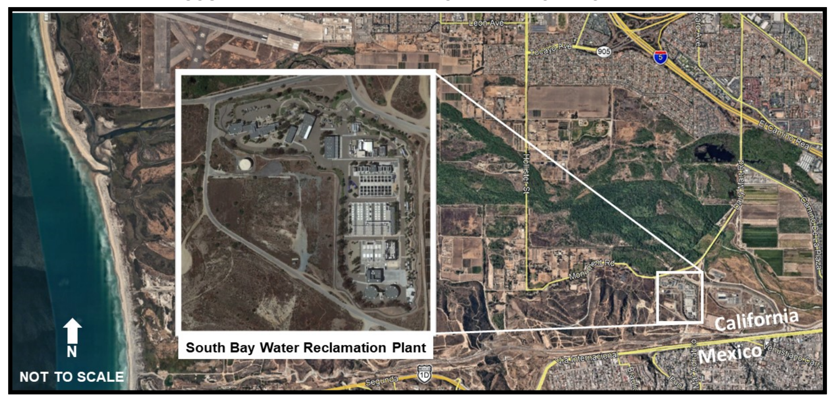
FIGURE 1 SOUTH BAY WATER RECLAMATION PLANT LOCATION MAP