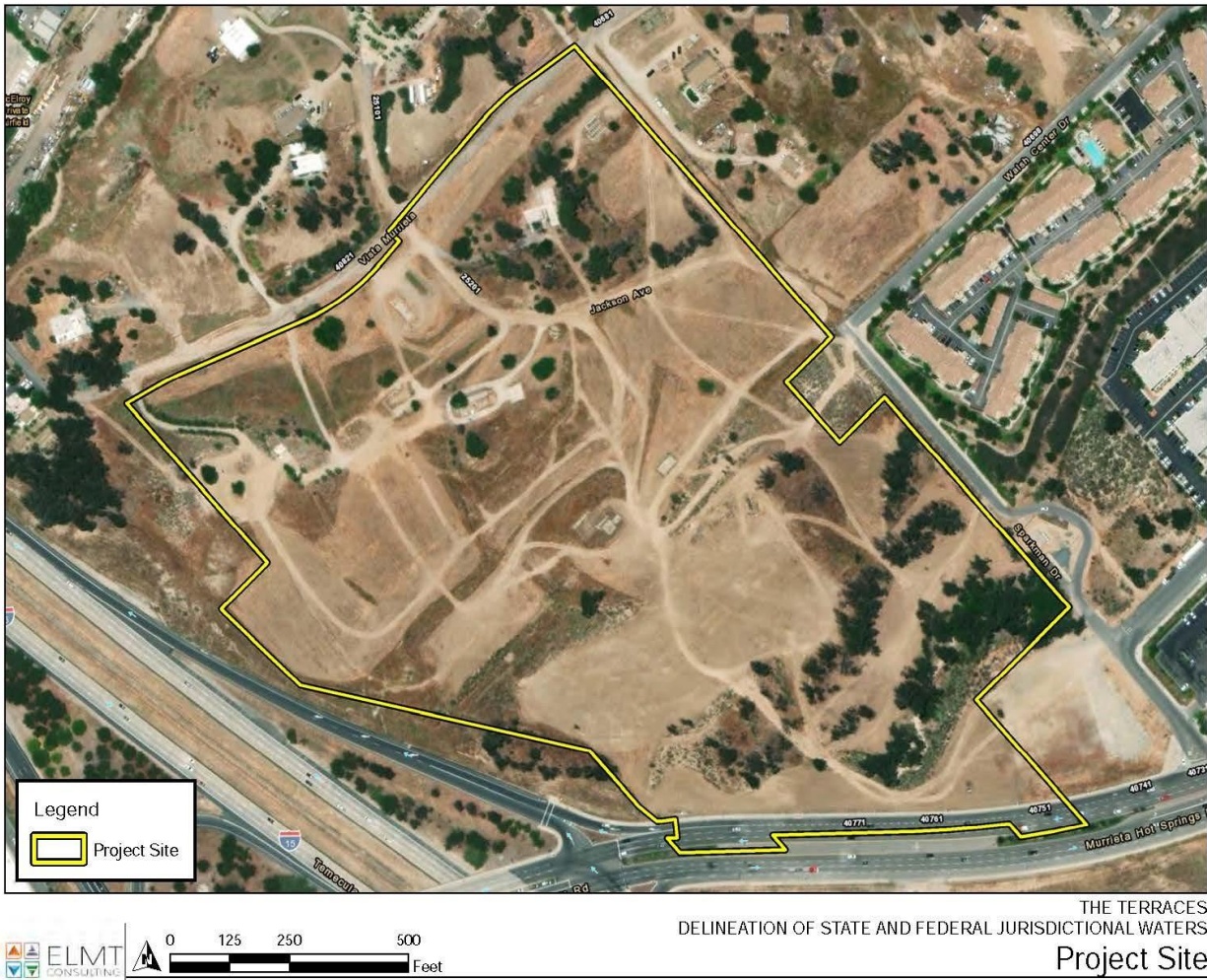
Figure 2. Project Site

Greystar The Terraces Tentative Order No. R9-2024-0077