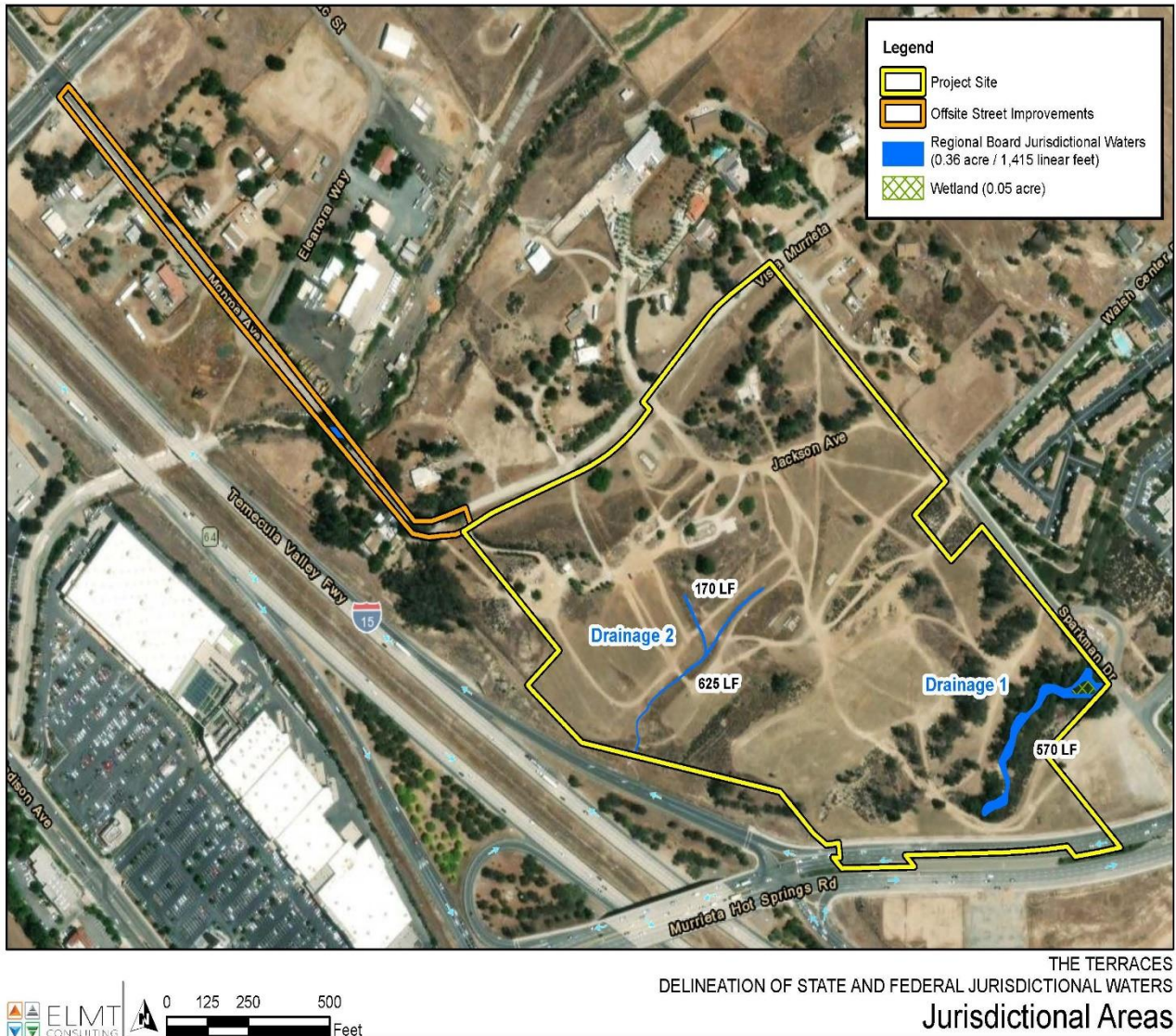
Figure 3. Jurisdictional Waters of the State

Greystar The Terraces Tentative Order No. R9-2024-0077