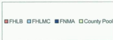
Solid Waste Environmental Trust Fund Historical Yield and Weighted Average Maturity

Current Book Value: $55,918,305.00 Yield to Maturity: 2.90% Portfolio WAM: 43 days