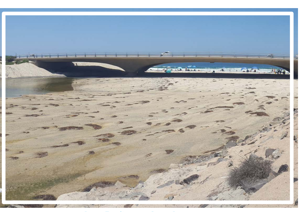
- Los Peñasquitos Lagoon -

Important to the economy & quality of life