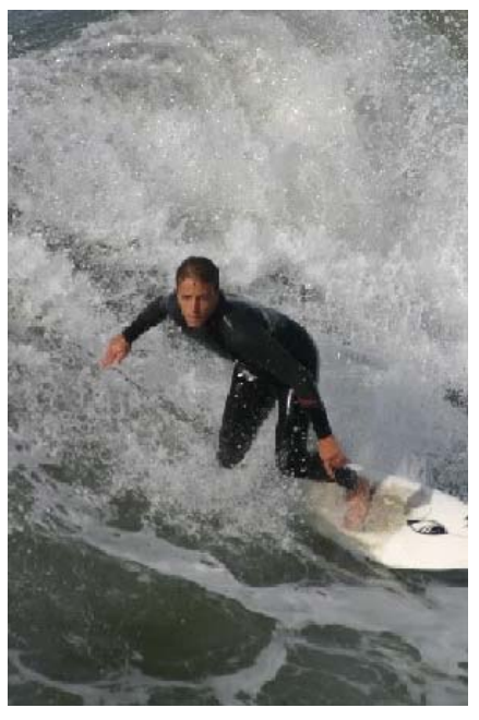
Surfer at Ocean Beach, San Diego County

In addition, the fecal coliform concentration shall not exceed 400 organisms per 100 ml for more than 10 percent of the total samples during any 30-day period.