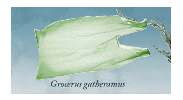
Our survey shows the public is willing to change from single use plastic to reusable/compostable.