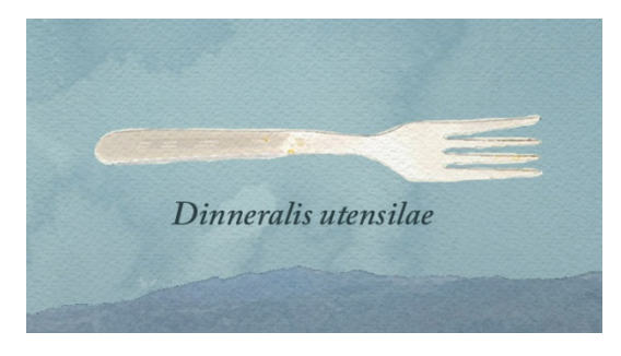
Our market research shows changing from single use plastic to more eco friendly alternatives costs 5¢ more per meal per person.