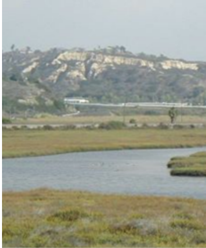
Los Penasquitos Lagoon

Estuarine Habitat (EST) - Includes uses of water that support estuarine ecosystems including, but not limited to, preservation or enhancement of estuarine habitats, vegetation, fish, shellfish, or wildlife (e.g., estuarine mammals, waterfowl, shorebirds).