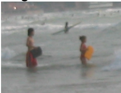
Beachgoers at La Jolla Shores