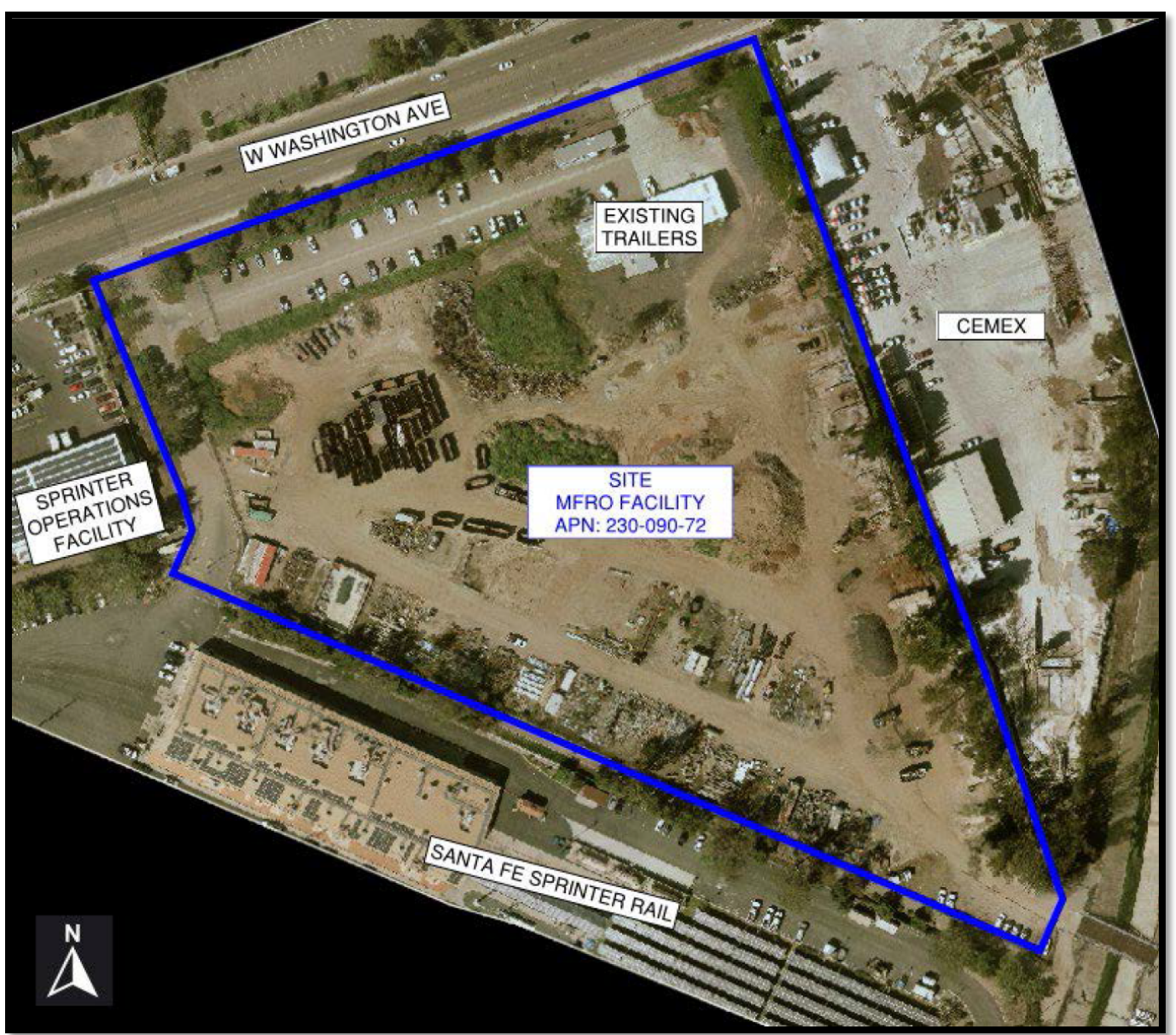
Figure is from the ROWD.