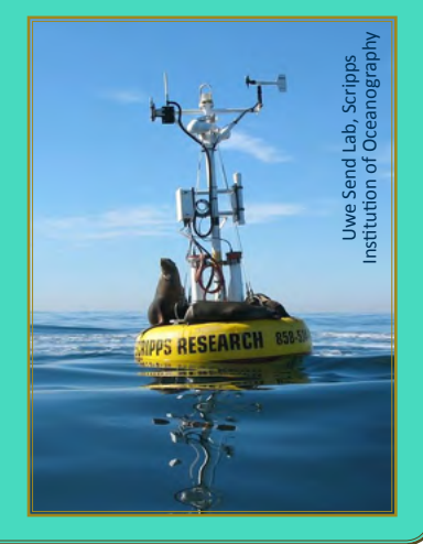
Bight '13 will use this type of mooring for ocean acidification monitoring.