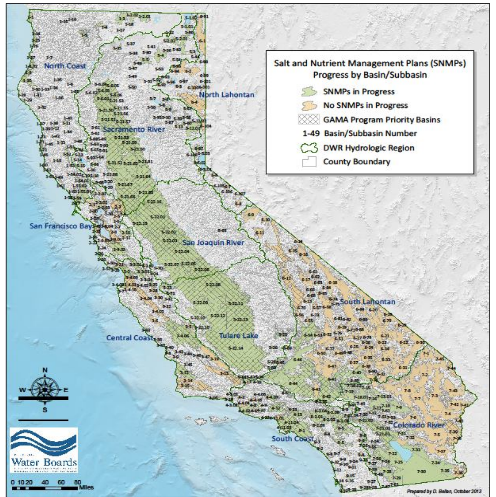
Figure 1. Salt and Nutrient Management Plan Progress in California Groundwater Basins

planning group participants, DWR grants for integrated regional water management, and the State Water Board cleanup and abatement fund. A summary of SNMP progress is shown in Table 1.