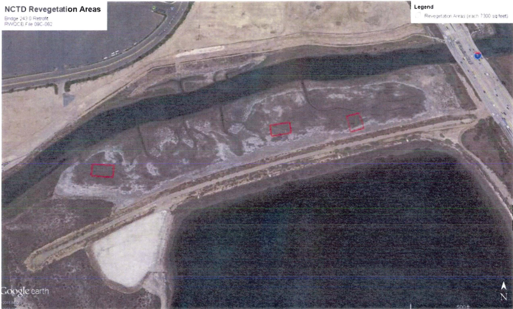
Figure 1. Proposed revegetation areas. Total area planted to be 0.5 acres.