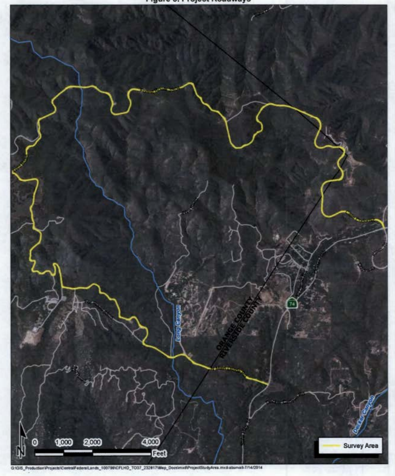
Figure 3. Project Roadways