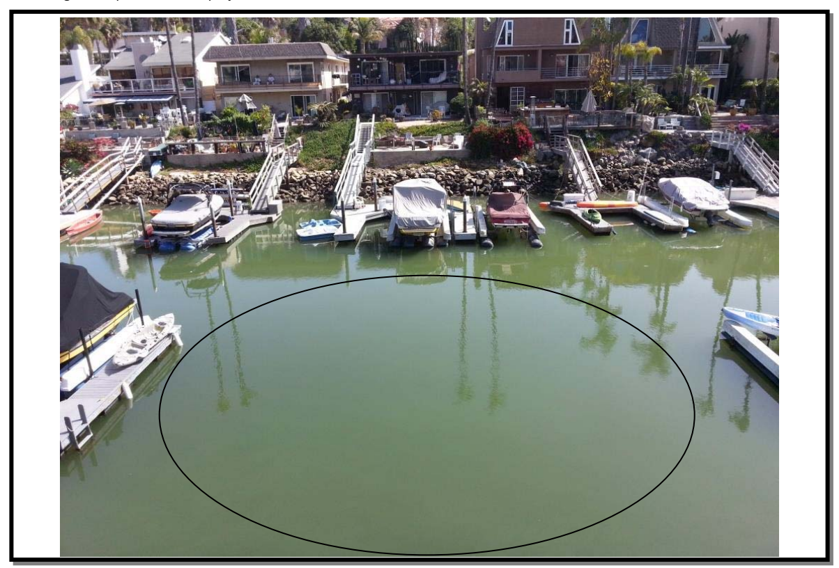
Photo Point 2. Photo of lagoon waters within project area (black circle). Photo taken from the limit of the parcel boundary and directed northeast.