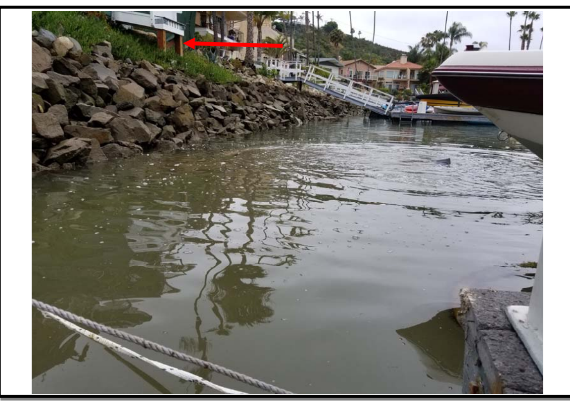
Photo Point 1. Photo of project area, taken on May 30, 2017 during the Baseline Eelgrass Survey and Caulerpa Survey. Photo taken from the northern boundary of the adjacent slip and directed northward into the proposed project parcel and associated slip. The red arrow is pointing to the existing access pier within the project area.