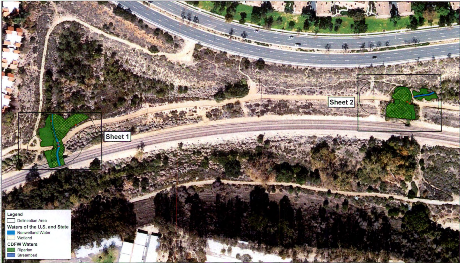
Figure 6 Overview Potential Jurisdictional Waters eTS 36213 Access Road Repair Z95965-Z95969 Rose Canyon