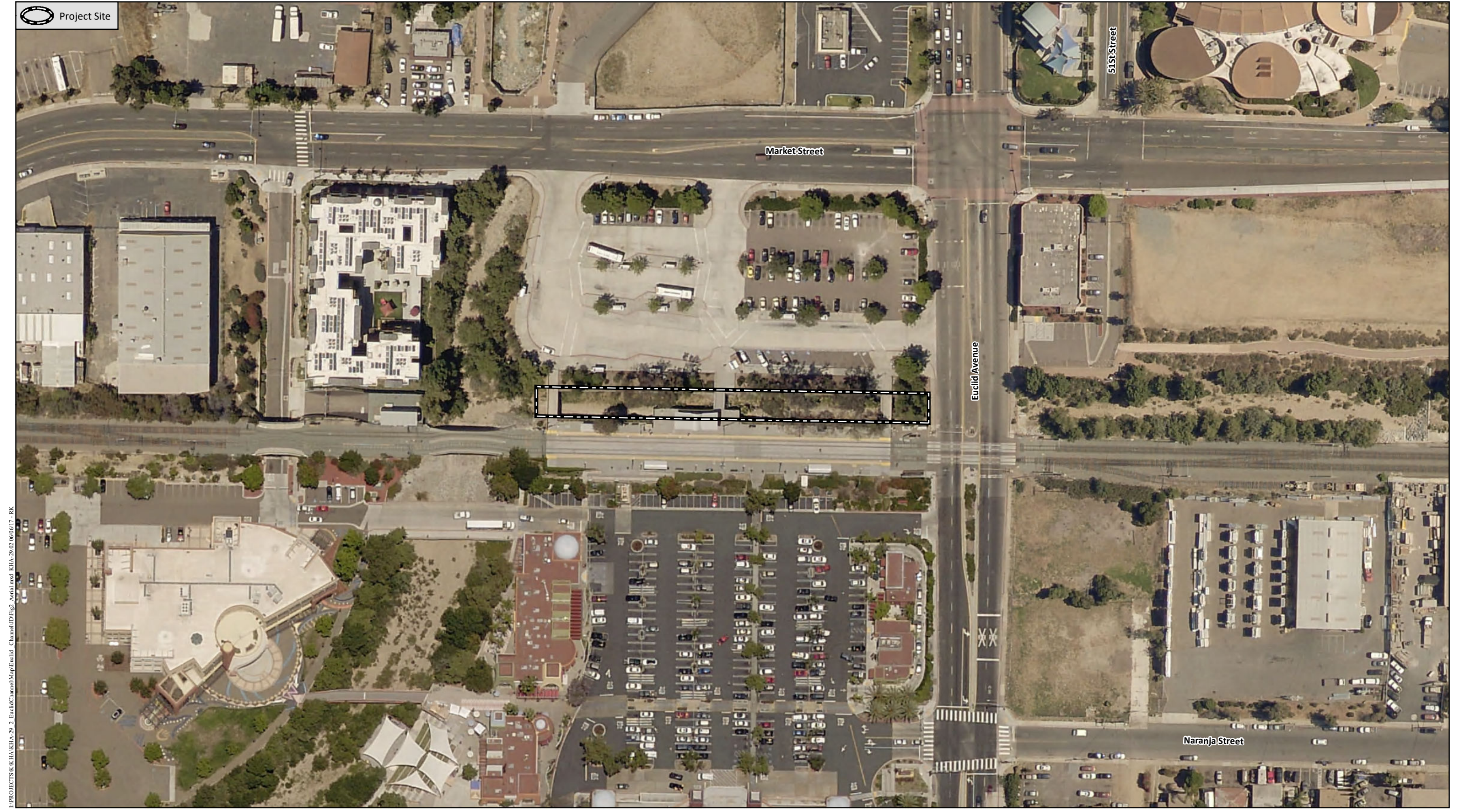
Project Vicinity (Aerial Photograph)