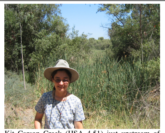
Kit Carson Creek (HSA 4.51) just upstream of North County Fair. Riparian habitat consists of oak woodland, willow, bulrush, and cattails.

Kit Carson Creek (HSA 5.21) near North County Fair Mall, at N33.06385 W117.06385, elevation 380 feet. 2005 San Diego Thomas Brothers page 1150 B2. Riparian habitat consists of oak woodland, willow, bulrush and cattails. Streamflow ~ 3 cfs on July 5, 2005 at 1100hrs. Stream channel 30 to 100 feet wide, depth ~ 3 inches.