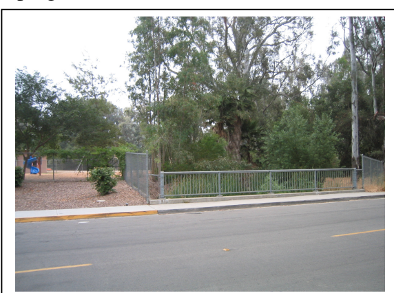
Green Valley creek (HSA 5.22) at Martincoit Road crossing (site 30).