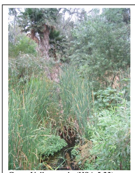
Green Valley creek (HSA 5.22)