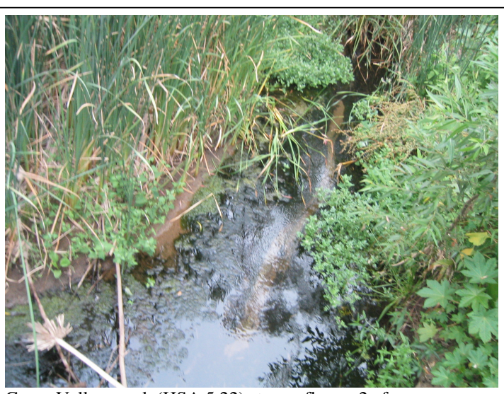
Green Valley creek (HSA 5.22) stream flow ~ 2 cfs.