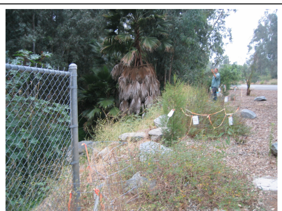
Native plant restoration in progress along banks of Green Valley creek (HSA 5.22).

Green Valley Creek (HSA 5.22) at Martincoit Road crossing [Site 30] located at N33.01534, W117,03988, elevation 324 feet. 2005 Thomas Brothers page 1170 E3. Streamflow ~2 cfs on July 5, 2005 at 0802hrs. Habitat consists of willow riparian, cattails, and exotics (castor bean, palm trees, eucalyptus.) Native plant restoration in progress.