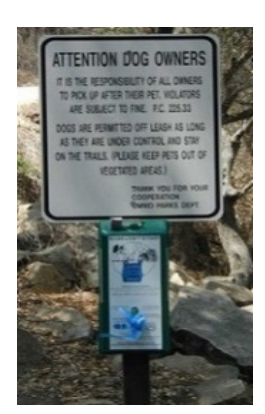
Best Management Practices

The permit objective is achieved by way of pollution prevention. To eliminate pollutants in storm water, one can either clean it up by removing pollutants or prevent it from becoming polluted in the first place. Because of the overwhelming volume of storm water and the enormous costs associated with pollutant removal, pollution prevention is the only approach that makes sense. Pollution prevention which means stopping the generation of pollution at its source by reducing the use of products containing pollutants, is in fact, the basis of the entire storm water program. Once pollutants have been generated, pollution control best management practices (BMPs) must be employed to prevent the existing pollution from coming into contact with the water of the State. It is important to point out that this approach is distinctly different from the