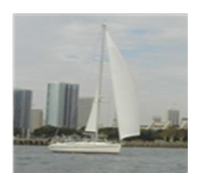
San Diego Bay sailboat

There are approximately 8,400 boat slips in San Diego Bay, 2,400 in Mission Bay, over 1,000 in Oceanside Harbor, and over 1,500 in Dana Point Harbor. In addition to boats with assigned slips, there are several hundred additional boats moored at a variety of "free" anchorages. In San Diego Bay, the San Diego Unified Port District has organized two of its free anchorages into formal anchorages which have shoreside showers, rest rooms, and docking facilities. Boat owners are required to pay fees for these services. In 1986, the San Diego Unified Port District was granted permission by the Coast Guard to establish additional formal anchorages in San Diego Bay. Because of the reluctance of some boat owners to pay fees for mooring in the bay, many have elected to move their boats to new free anchorages. Such anchorages can be especially important sources of human pathogens from vessel sewage releases. In addition to the vessels normally maintained in the water, there are several thousand additional "trailer" boats using San Diego's boat harbors. In total, approximately 55,000 vessels are registered in San Diego County.