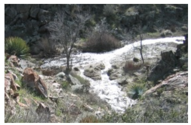
Noble Canyon Creek

Riparian and stream habitats provide natural beauty which is appreciated and valued by people. Riparian and stream habitats, especially in urban areas, are vital to enhancing our quality of life. People are far more likely to respect and be stewards of "natural" reaches of streams than channelized or artificially modified reaches. Riparian lands represent a significant value to society.