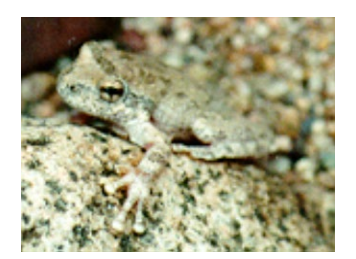
California tree frog

Section 404 of the Clean Water Act requires the USEPA, in conjunction with the USACOE, to promulgate guidelines for the discharge of dredged or other fill material to ensure that such proposed discharge will not result in unacceptable adverse environmental impacts to waters of the United States. Section 404 assigns to the USACOE the responsibility for authorizing all such proposed discharges, and requires application of the guidelines in assessing the environmental acceptability of the proposed action. The USACOE and the USEPA also have authority under section 230.80 to specify, in advance, sites that are either suitable or unsuitable for the discharge of dredged or fill material in US waters. In addition, Clean Water Act section 401 provides the States a certification role as to project compliance with applicable water quality standards.