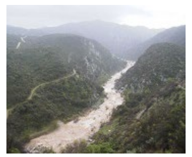
Santa Margarita River