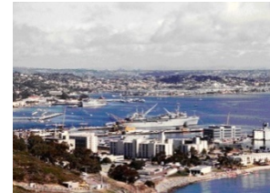
San Diego Bay

The Water Quality Control Policy for Enclosed Bays and Estuaries of California (Enclosed Bays and Estuaries Policy) was adopted by State Board Resolution No. 74-43 on May 16, 1974. This policy is designed to prevent water quality degradation and protect beneficial uses in enclosed bays and estuaries. The policy outlines water quality principles and guidelines to achieve these objectives. Decisions by the Regional Board must be consistent with the provisions designed to prevent water quality degradation.