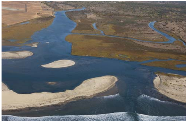
Tijuana River mouth

The following areas are managed by the U.S. Fish and Wildlife Service as part of the National Wildlife Refuge System. A legal description of the boundaries of each National Wildlife Refuge is on file at the San Diego National Wildlife Refuge Complex, 6010 Hidden Valley Road, Carlsbad, CA 92011: