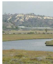
Los Penasquitos Lagoon

Estuarine Habitat (EST) - Includes uses of water that support estuarine ecosystems including, but not limited to, preservation or enhancement of estuarine habitats, vegetation, fish, shellfish, or wildlife (e.g., estuarine mammals, waterfowl, shorebirds).