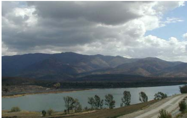
Lower Otay Reservoir

A listing of coastal waters in the San Diego Region and the existing and potential beneficial uses of each are summarized in Table 2-3.