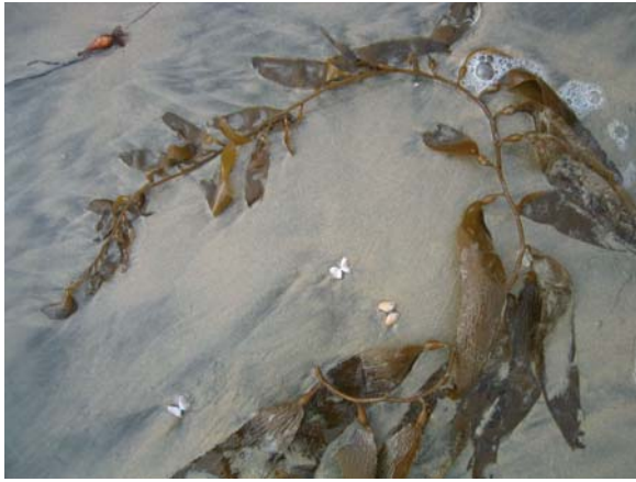
Kelp on beach at San Diego – La Jolla Ecological Reserve

Preservation of Biological Habitats of Special Significance (BIOL) - Includes uses of water that support designated areas or habitats, such as established refuges, parks, sanctuaries, ecological reserves, or Areas of Special Biological Significance (ASBS), where the preservation or enhancement of natural resources requires special protection.