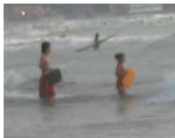
Beachgoers at La Jolla Shores

Hydropower Generation (POW) - Includes uses of water for hydropower generation.