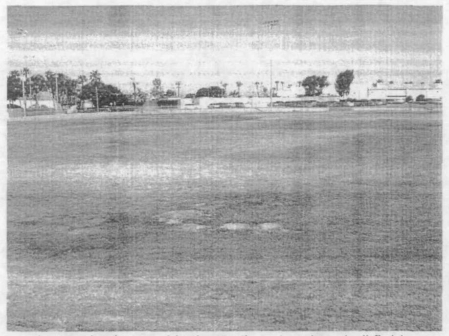
Rodent holes and mounds observed in the northeastern baseball field.