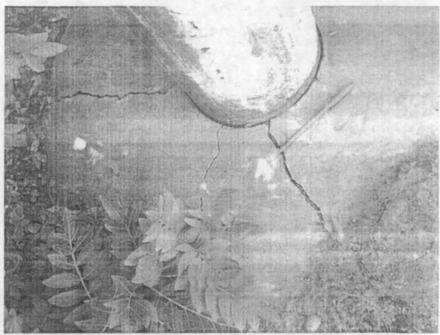
Cracked concrete surface seal of MW-2.