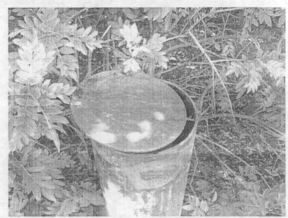
Unlocked protective steel well head cover of MW-2.