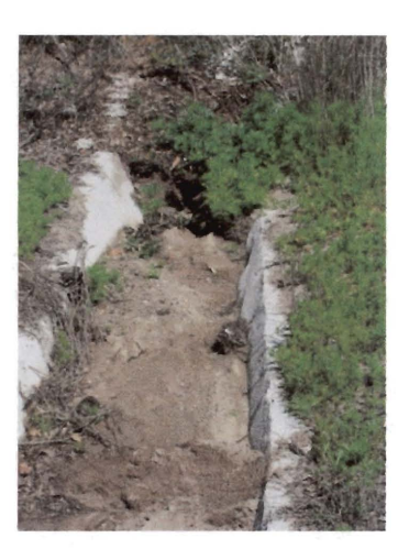
Inadequate maintenance of site drainage.