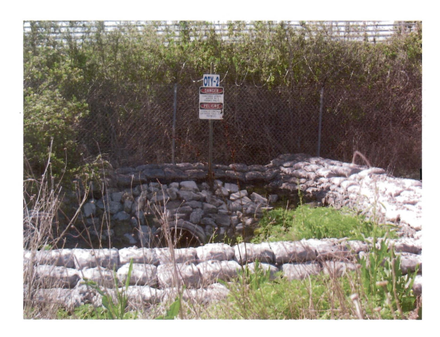
Gravel bags need to be replaced at stormwater sampling point OTY-2.