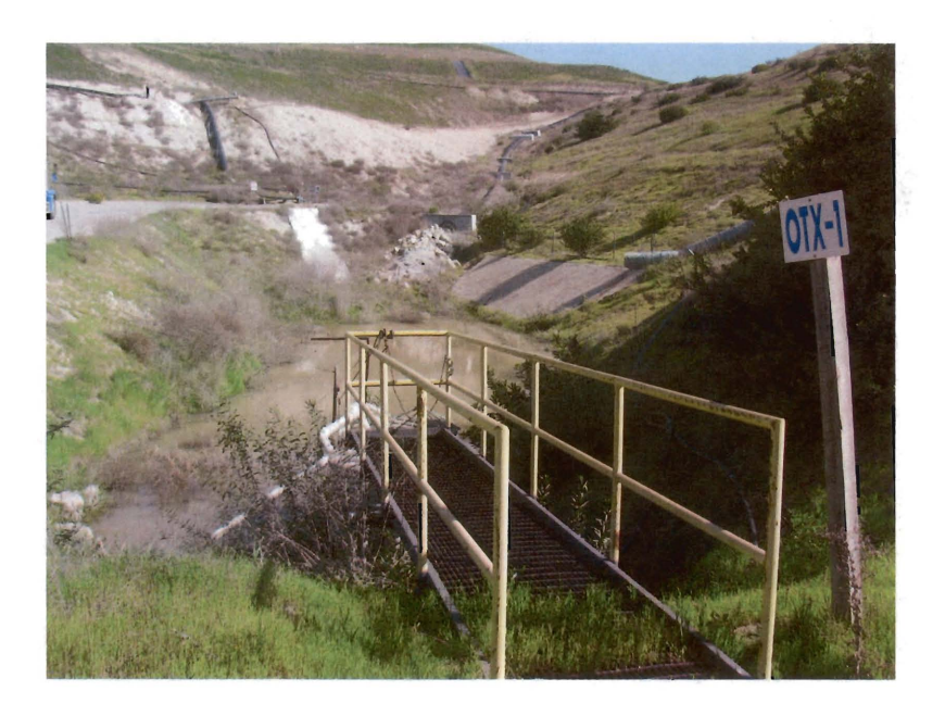
Stormwater sampling point OTX-1