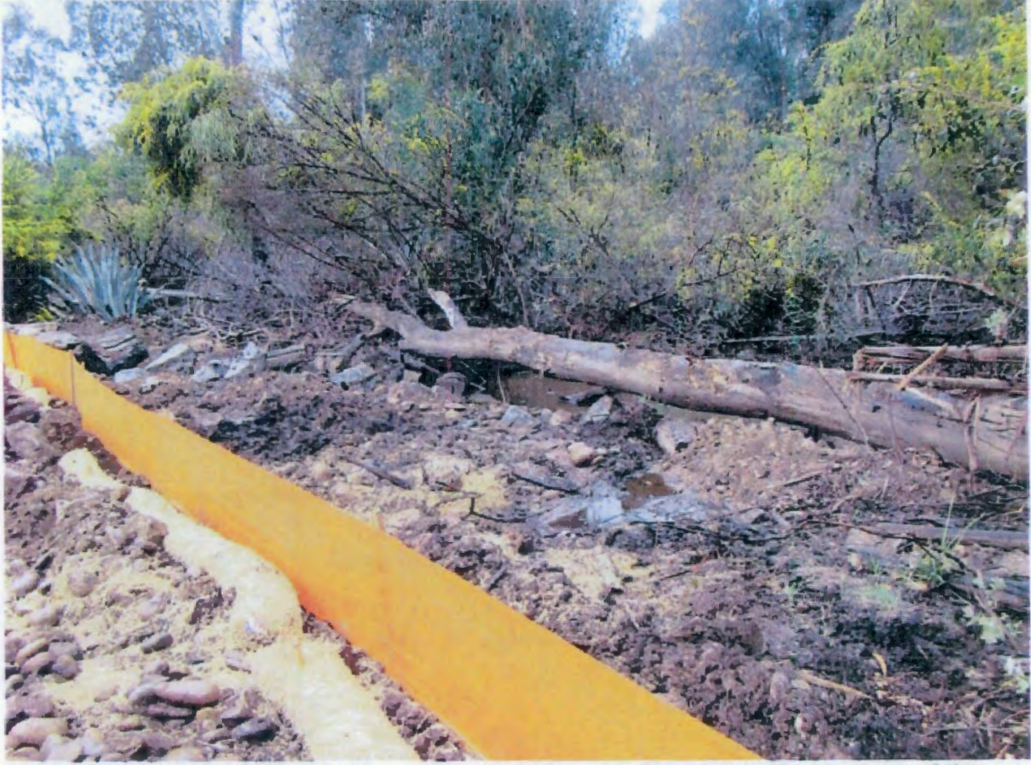
Photo 7 –Construction activities and debris have entered entering waters of the United States and/or State.

6. Area in which material from construction site was entering adjacent tributary is shown below in Photo 7.