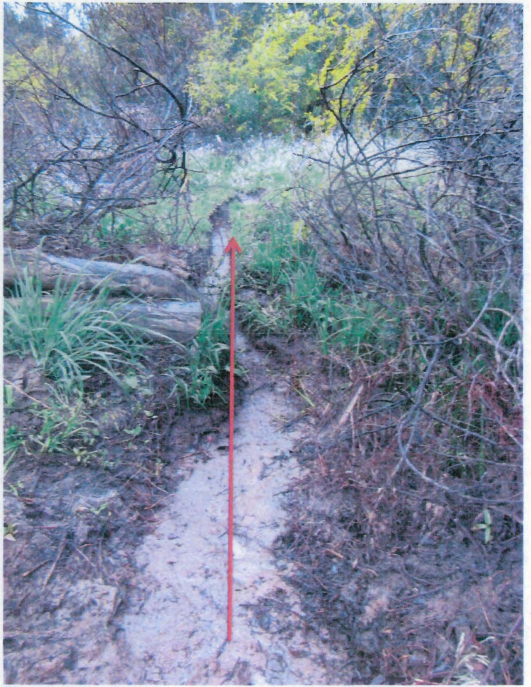
Photo 6 – Area in which pipe outfall flows north into tributary. Direction of flow in red.

5. Area in which the outfall flows into the tributary shown in Photo 6 below.