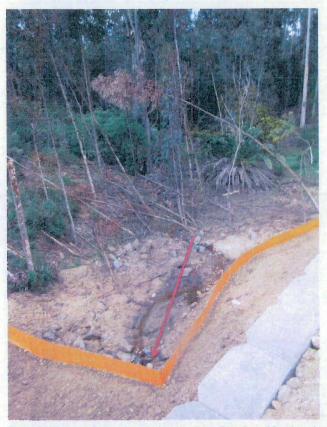
Photo 3 - Unnamed tributary entering pipe inlet. Direction of flow in red.