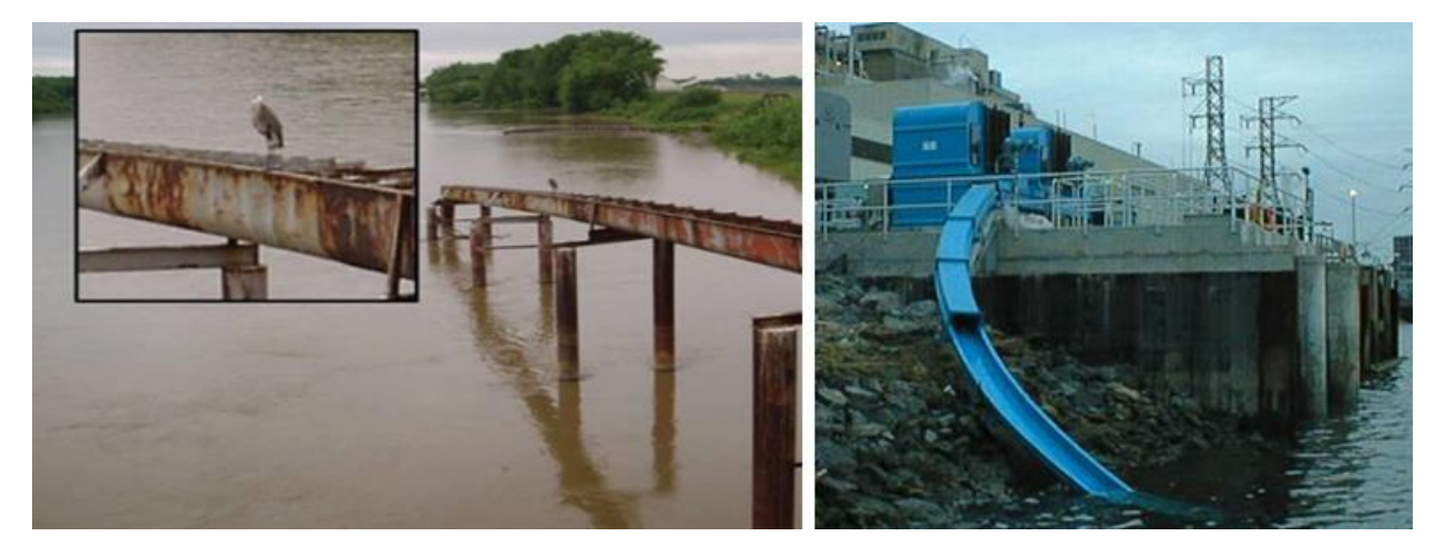
Figure 3. Avian predator perched on fish return system (left) and fish return properly covered to minimize risk of avian predation (right). Note that the image on the right shows the return trough uncovered up to the high water line so that discharge is always free surface regardless of tidal elevation.

of fish returns. To expand on the topic of predation at fish return discharges, it is important to note that predation refers to both terrestrial (mostly avian [Figure 3], but small mammal predation can occur at some sites) and aquatic predation.