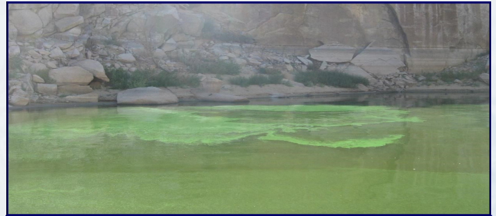
Figure 3. A cyanobacteria bloom (of Microcystis and Aphanizomenon ), exhibiting the common resemblance to spilled paint or pea soup, at Morena Reservoir on September 18, 2013, when recreational action thresholds

Microcystins were also widespread in the San Diego region’s lakes/reservoirs and coastal wetlands in 2013. All study sites, which included 10 lakes/reservoirs and 9 coastal wetlands, were sampled 3 times throughout the screening period. Dissolved microcystins, measured by passive sampler, were detected in at least 1 of the 3 sample visits from each site. In contrast, particulate microcystin results obtained from the discrete samples suggested that 26% of the sites had measurable particulate microcystins throughout the study period, indicating that discrete samples can miss toxin events that are detected by passive