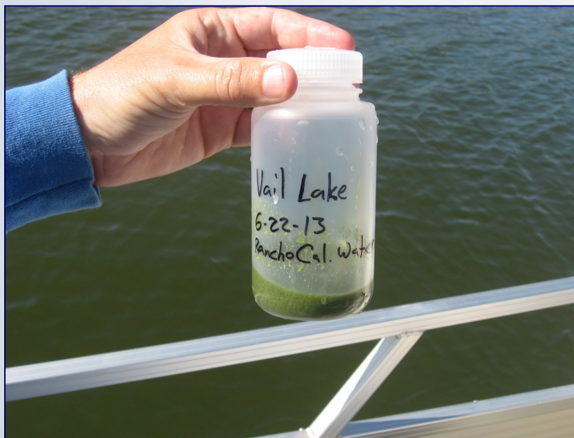
Figure 1: Sample taken at Vail Lake

Recent assessments in southern California have indicated that microcystins, a toxin produced by many cyanobacteria, are found in a variety of lentic (still) waterbody types, such as lakes and wetlands. Although low levels of microcystins were found across most of the examined habitats; only a small number of samples exceeded California's voluntary recreational health thresholds for acute toxicity. Furthermore, passive sampler results indicated that dissolved microcystins were widespread throughout lentic waterbodies, and that traditional discrete ('grab') water samples often underestimate toxin presence by