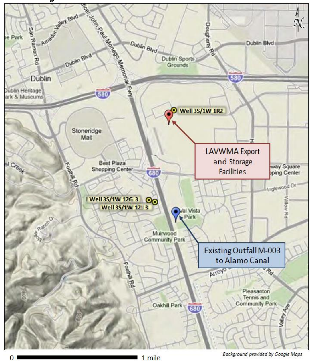
Figure B-3 Detailed View of Alamo Canal Outfall Location