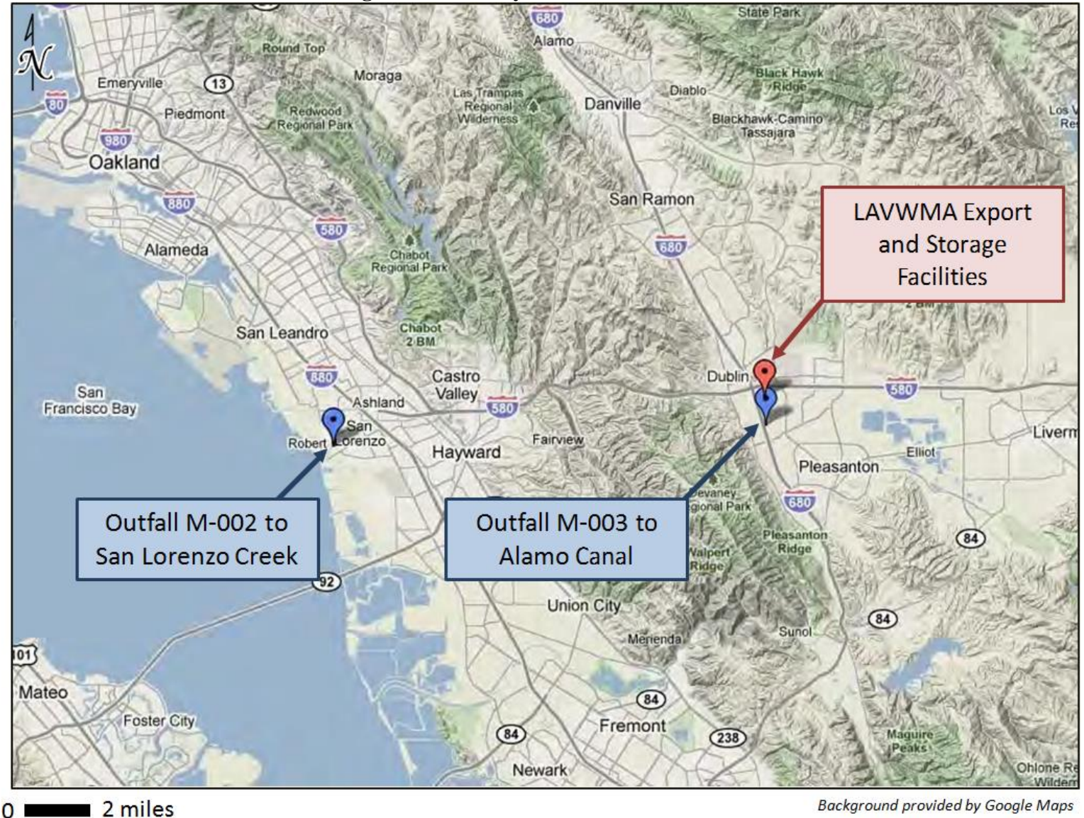
Figure B-1 Facility and Outfall Locations