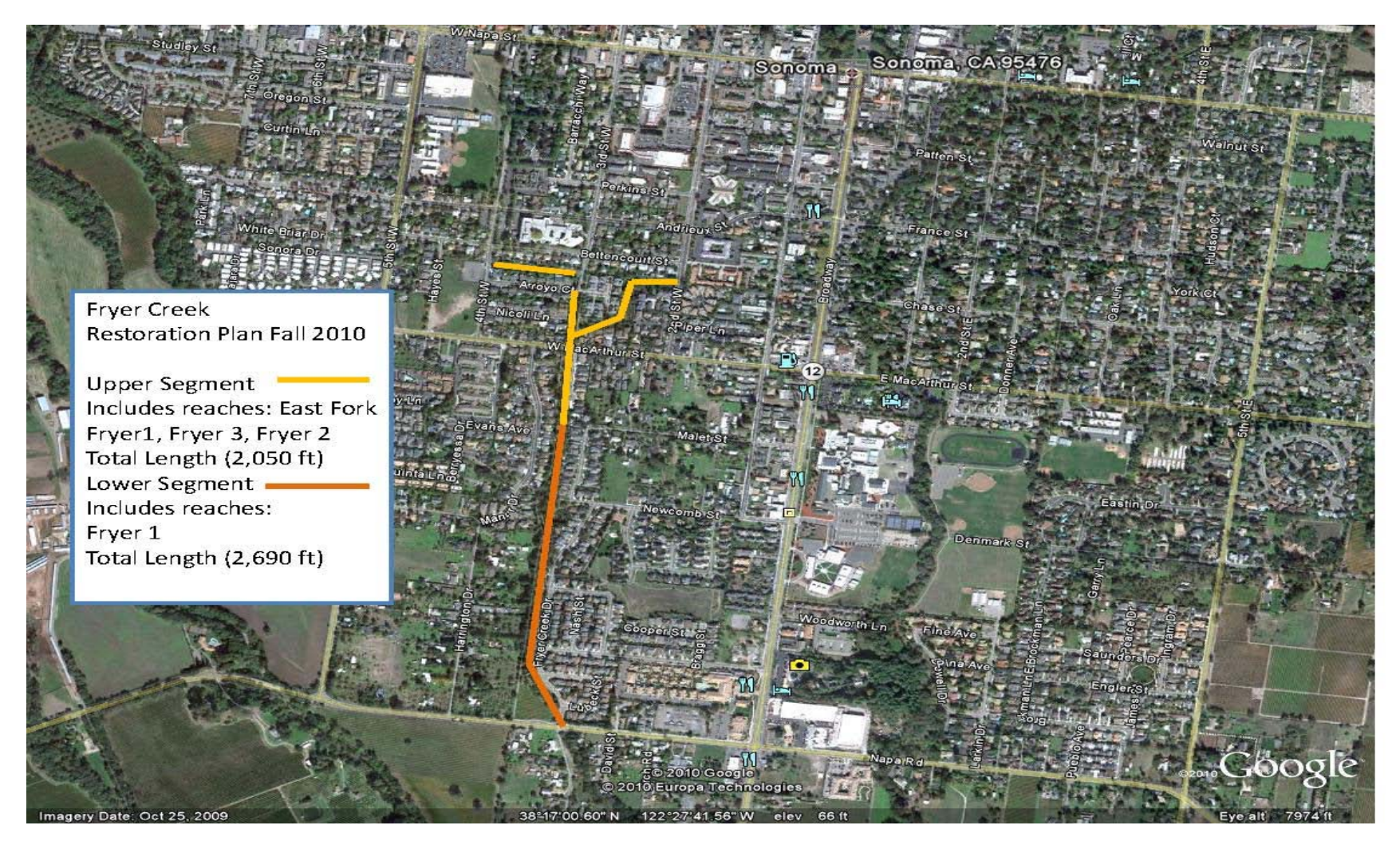
Figure 2. Fryer Creek Restoration Plan Section and Location Map