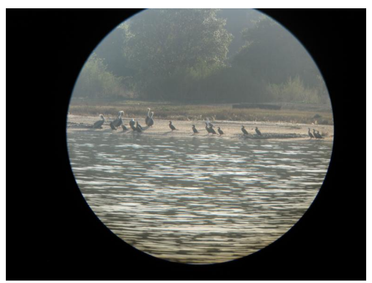
Birds enjoying the Aramburu shoreline

brown pelicans on Aramburu before. Preliminary post-restoration data indicates that more birds are using Aramburu since the reconstruction of the shoreline to a more stable configuration and addition of appropriately-sized beach material. The next phase of the Project will entail removing non-native and invasive plant species and revegetating the Island.