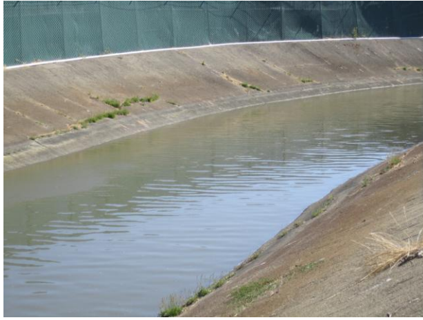
Section of Millbrae Canal that will be placed in culvert

As a result, as part of its application to the Board for Water Quality Certification, SFO submitted a comprehensive mitigation plan that called for purchase of tidal wetland credits at a ratio of about 5:1 at the Deepwater Island Slough project in Redwood City. SFO has also entered into a Memorandum of Understanding with the Presidio Trust to fund about 7.5 acres (mitigation ratio of about 2:1) of planned wetland and riparian restoration projects, including Quartermaster Marsh, YMCA Reach, and Mountain Lake East Arm at the San Francisco Presidio. This mitigation plan is consistent with Board staff's expectations for RSA project mitigation.