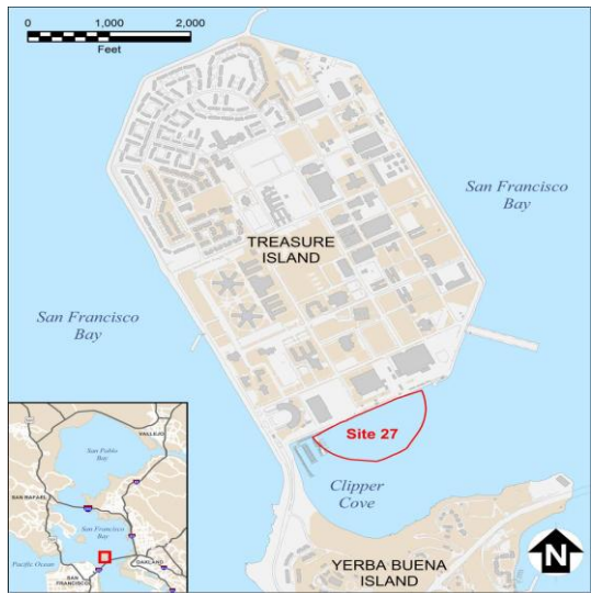
Figure 1a. Yerba Buena Island Location Map with Site 27 in red.

Last month, I signed a record of decision (ROD) documenting the selected cleanup remedy for the Clipper Cove Skeet Range at the former Treasure Island Naval Station. The Clipper Cove Skeet Range, also known as Site 27, is an approximately 19 acre area located offshore between Treasure Island and Yerba Buena Island (Figures 1a and 1b). The Treasure Island Marina currently occupies a small portion of the former skeet range and is the intended future use for Clipper Cove.