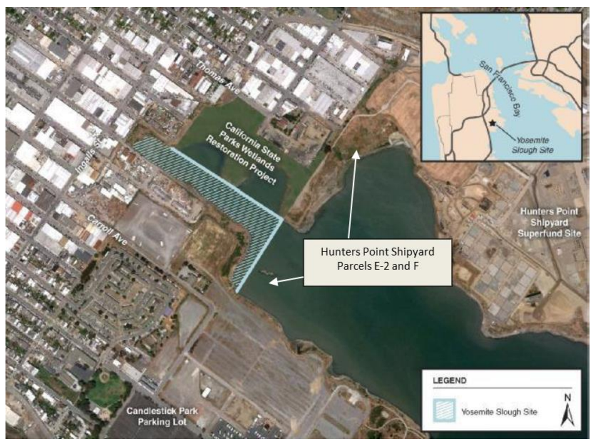
Figure 2: Location of Yosemite Slough, with respect to the California State Parks Yosemite Slough Wetland Restoration Project and Hunters Point Naval Shipyard Parcels E-2 and F. Yosemite Slough and Parcel F are slated for PCB sediment cleanup.

Francisco Bay, between Hunters Point Naval Shipyard to the north and Candlestick Point State Recreational Area to the south (see Figure 2). The Slough, now approximately 1,600 feet long and 200 feet wide, once consisted of a large network of tidal marshes and mudflats, but was narrowed by placement of fill materials between 1900 and 1970. The Slough sediments are contaminated with PCBs from a defunct drum recycling facility.