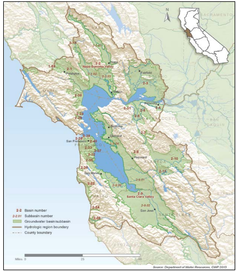
Figure 1. Map of alluvial groundwater basins and subbasins of the San Francisco Bay hydrologic region.

This work involves preparing basin "quick looks" for 14 of our higher use groundwater basins that summarize groundwater use, quality, and management. The information will help us identify supply well impacts that require contaminant source investigation and prioritize where we should push for GSPs and SNMPs. In November, for example, the team provided comments on the Napa Valley Groundwater Sustainability Plan (Figure 2), noting our concern about potential declining groundwater contributions (baseflow) affecting several Napa River tributaries that provide important aquatic species habitat.