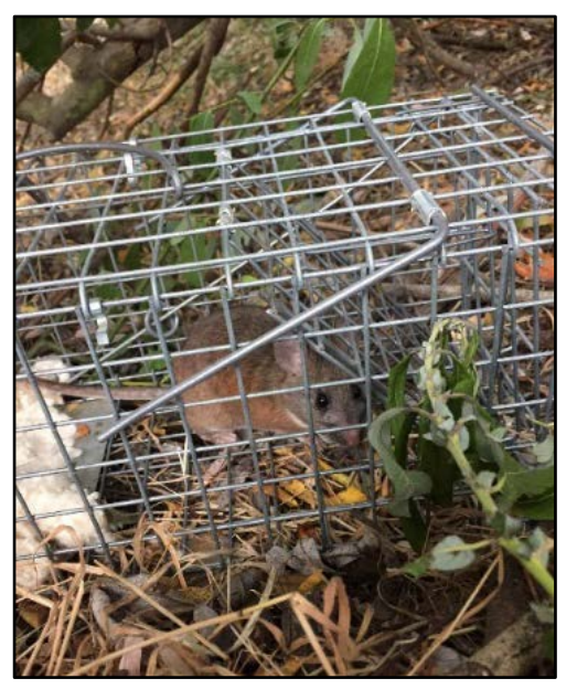
Figure 5. Dusky-Footed Wood Rat trapped for relocation prior to excavation

We will monitor restoration through review of the Project's Implementation Report (describing mitigation and restoration measures implemented during construction) and review annual reports describing restoration monitoring and maintenance. These activities are part of our continual support of the cleanup activities at SLAC.