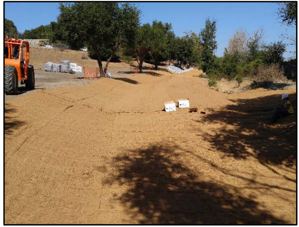
Figure 4. Completed Drainage Channel with erosion control matting

In accordance with the plan, excavation, backfilling, and initial restoration with grass seed and erosion control was completed in August and September (Figures 3 and 4). Best Management Practices (BMPs) were used to minimize contaminated sediment conveyance to, and deposition in, the channels.