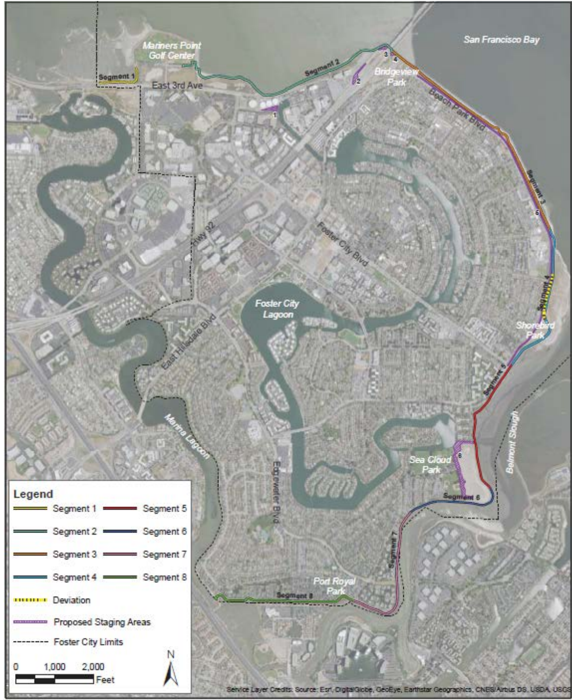
Figure 6. Map of Levee Segments

2050 sea level rise elevations would continue to provide adequate flood protection in the 2100 sea level rise scenario, Foster City staff stated that outboard structures such as coarse sediment beaches, oyster reefs, and similar "living shorelines" would be necessary. This came as a pleasant surprise to Board staff and is in line with what we have been recommending. The City's consultants stated that they would set up a meeting with us in the near future to discuss the project design prior to submittal of their application for water quality certification.