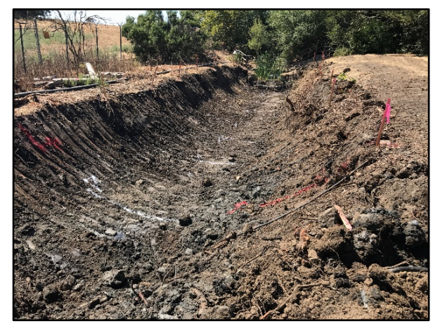
Figure 3. Excavation of IR-8 Drainage Channel

The 3.91-acre project site (Figure 2) includes two channels (IR-8 and IR-6) that convey stormwater and sediment runoff from the SLAC campus to San Francisquito Creek via two culverts. IR-8 is perennially fed by groundwater from the underdrain system beneath the linear particle accelerator tunnel. IR-6 is intermittent and consists of two channels (IR-6 primary and IR-6 secondary) separated by an earthen berm vegetated with grasses, plants, and trees. Riparian woodlands occur on both sides of IR-8 and a perennial freshwater marsh occurs near the IR-6/8 confluence.