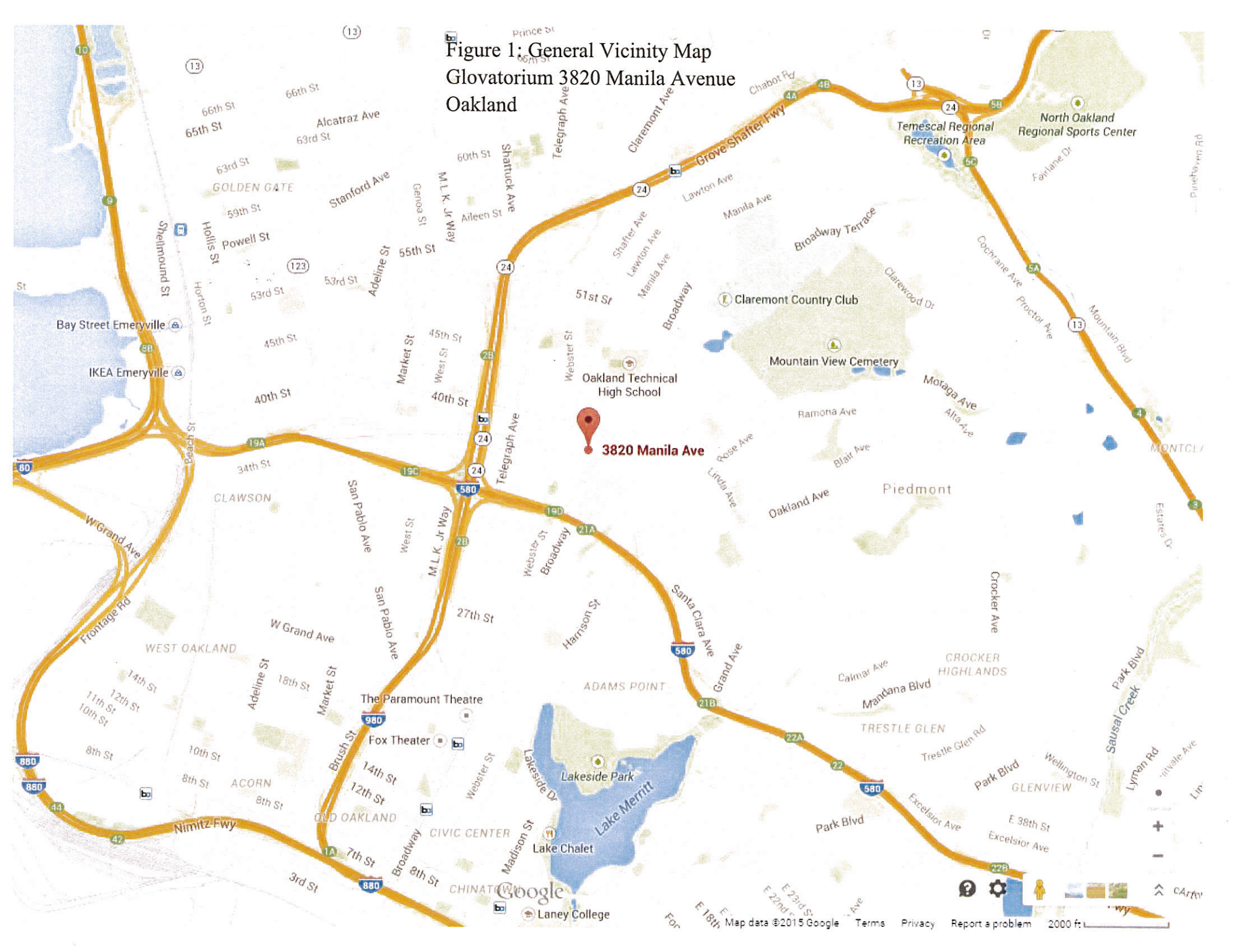
Figure 1: General Vicinity Map Glovatorium 3820 Manila Avenue Oakland