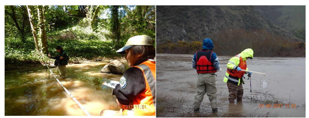
Figure 3. Sampling mercury concentrations during stormwater conditions in Walker Creek