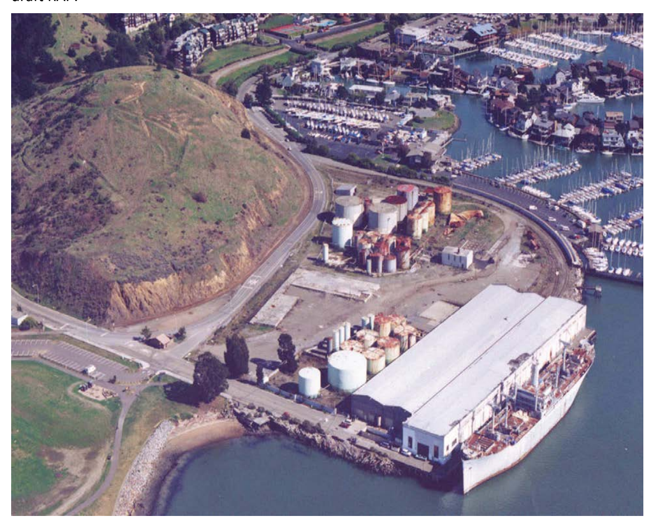
Figure 2: Aerial Photograph of Richmond Terminal One Site (2002). Southwestern Tank Farm is adjacent to Warehouse, and Northeastern Tank Farm is adjacent to Yacht Club.

in November 2017, reported those data in a preliminary draft RAP. Board staff's comments have been substantively addressed through two revisions, culminating in the current 2018 draft RAP.