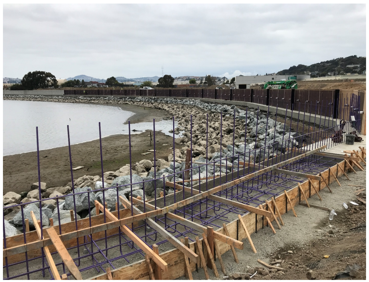
Figure 2. Construction of the parcel E-2 seawall and revetment (August 30, 2018)