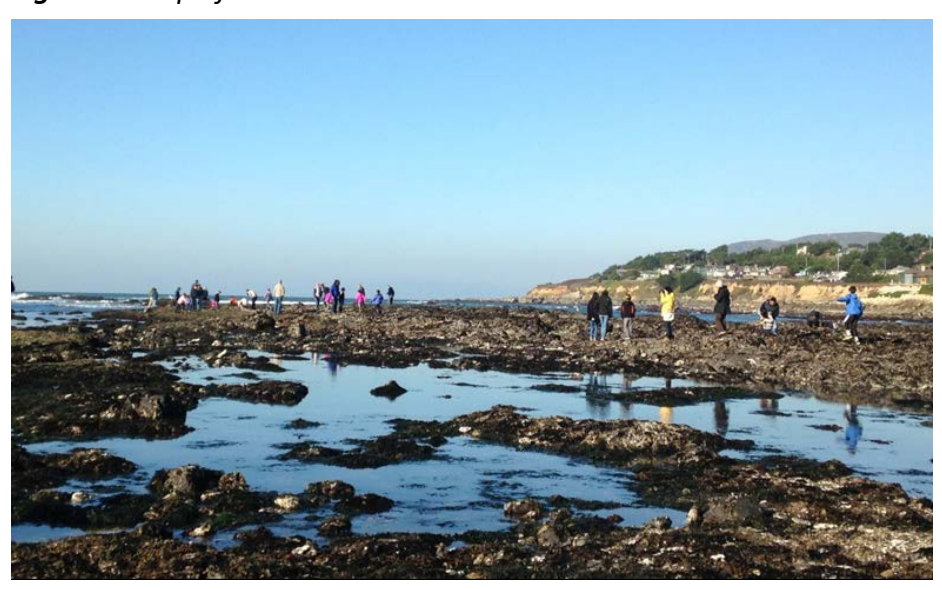
Figure 2. San Vicente Creek flowing into Fitzgerald Marine Reserve at the Pacific Ocean