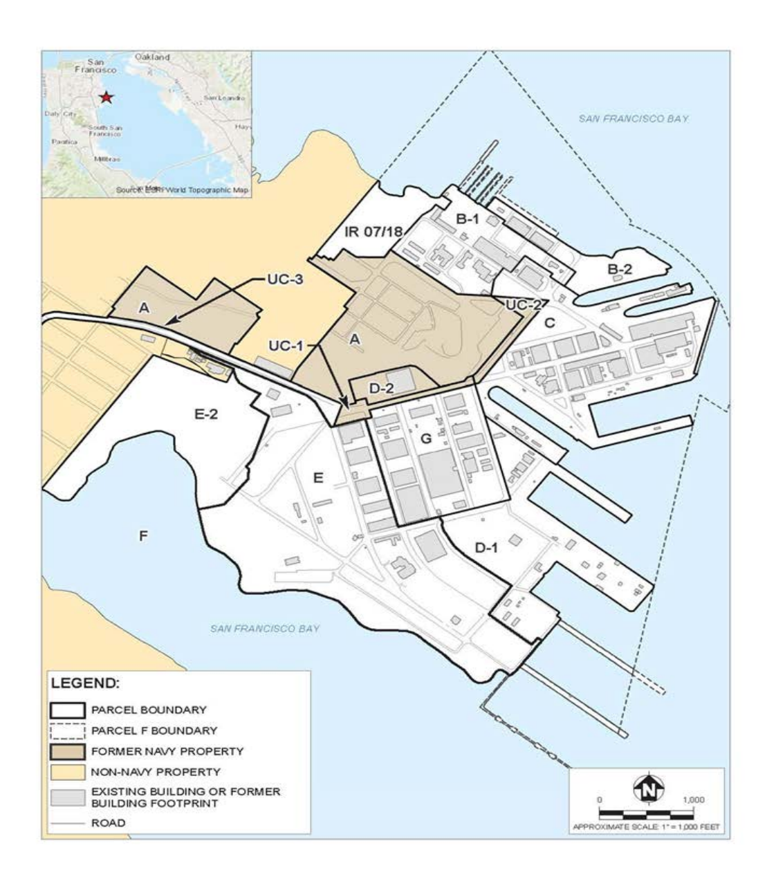
Figure 1. Hunters Point Naval Shipyard Parcel Map