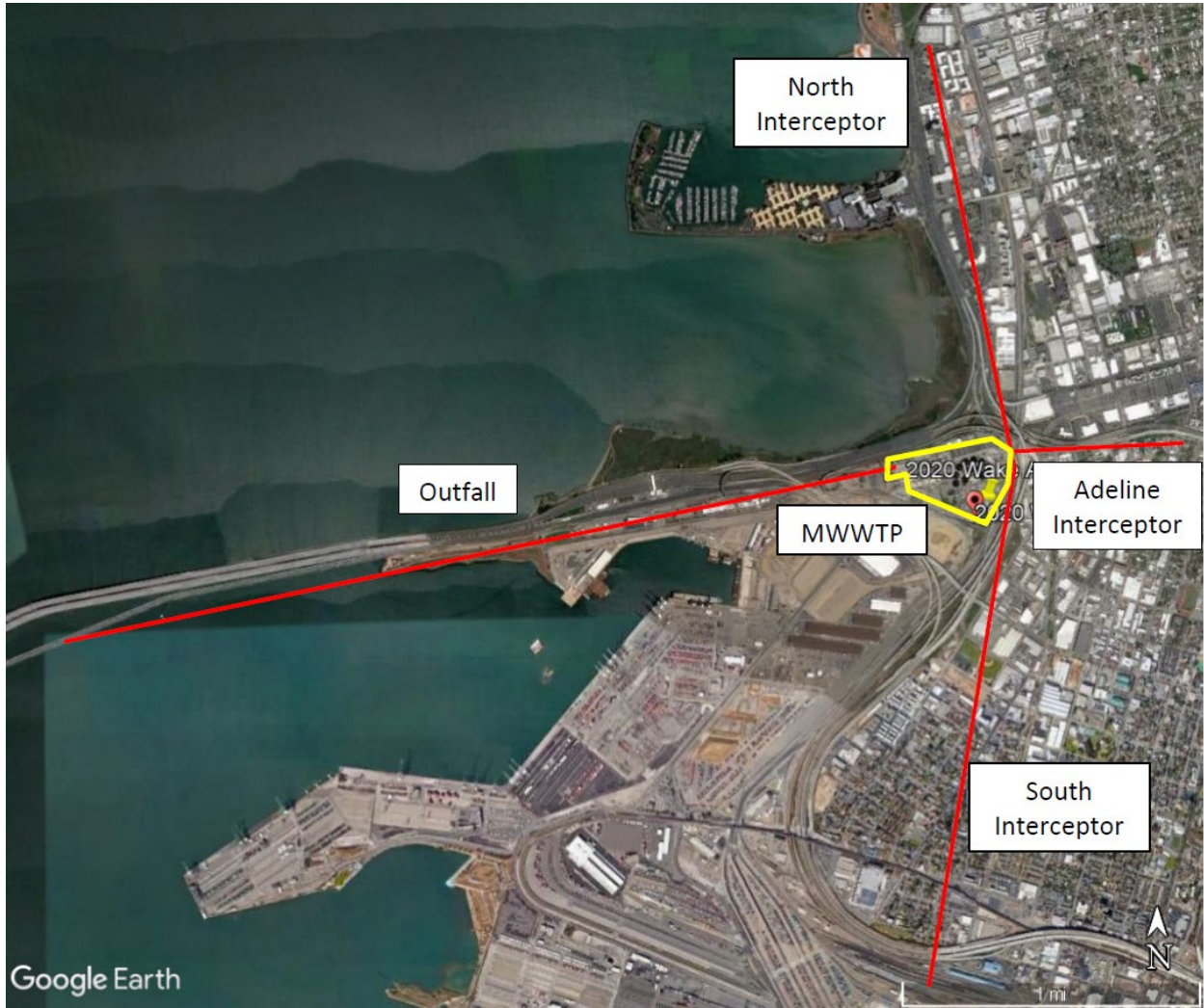
Figure B-1. Topographic / Satellite Map of Major Pipes and Structures