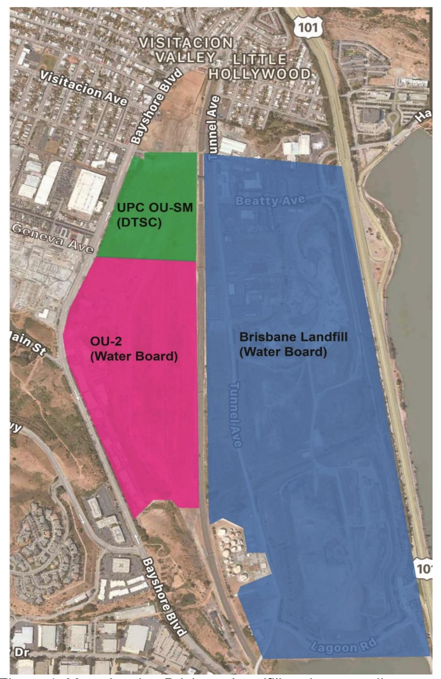
Figure 1: Map showing Brisbane Landfill and surrounding areas

Water Board staff received comments from the community to the draft OU-2 FS/RAP and intends to respond to comments in the coming weeks.