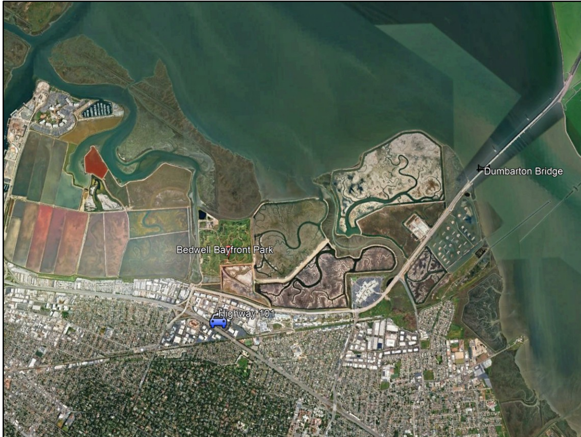
Figure 1. Bedwell Bayfront Park Landfill Site Location Map.