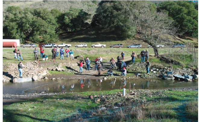
Figure 2. Field monitoring meeting in Sonoma County, California.

quality protection practices during and following the short course.