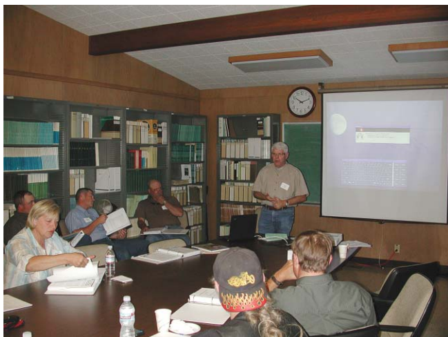
Figure 1. Ranch Water Quality Management Planning short course meeting.

pollution, 2) become knowledgeable about water quality impairments in the watershed or basin in which their ranch was located, and 3) have a basic understanding of state (California's Porter-Cologne Act) and federal (Clean Water Act and Coastal Zone Management Act) water quality regulations. We used visual media to help ranchers visualize sources of sediment, nutrients, pathogens, and increased surface water temperature. We then reviewed the beneficial uses and the NPS pollution assessments of water bodies in the basins where course participants had ranches. We reviewed the 303(d) list of impaired water bodies required by the Clean Water Act, 1 and we reviewed the total maximum daily load (TMDL) priority list for those basins. Once the ranchers were familiar with state and basin assessments that may affect their property and watersheds, we had the ranchers complete an NPS self-assessment checklist. The checklist asks the ranchers to identify sediment, nutrient, pathogen, and thermal pollution sources and streambank/riparian conditions on their ranch.