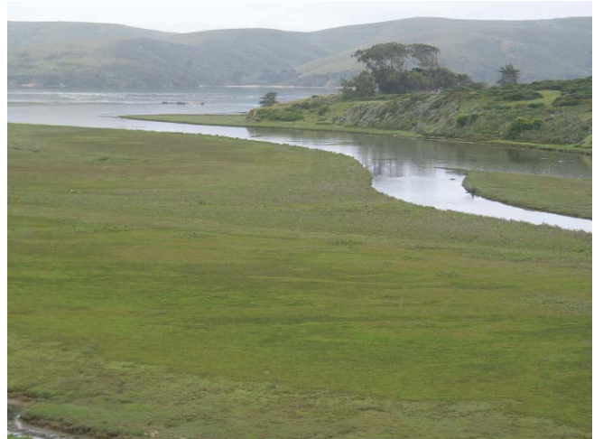
Figure 4. Tomales Bay Watershed.

The watershed supplies water, provides recreational opportunities, and supports dairy and beef ranching, farming, commercial fishing, and oyster production. The Tomales Bay Watershed is home to rich wildlife communities, including nearly 470 species of birds. Coho salmon ( Oncorhynchus kisutch ), steelhead trout ( Oncorhynchus mykiss ), and red-legged frogs ( Rana draytonii ) are important examples of threatened