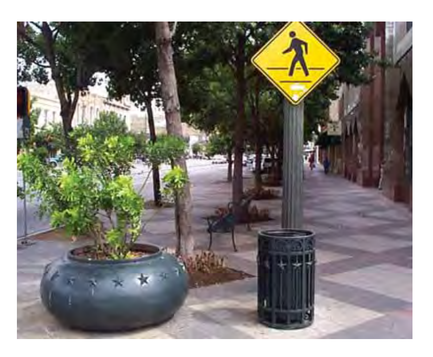
Urban trees intercept rainfall before it hits the ground and is converted to stormwater runoff.

controls, like permeable pavements, are not vegetated but designed to provide the water detention and retention capabilities of natural systems. Green infrastructure also encourages downspout disconnection programs that redirect stormwater from collection systems to vegetated areas or that capture and reuse stormwater, such as rain barrels. Downspout disconnection removes stormwater volume from collection systems and allows green infrastructure components to manage the runoff.