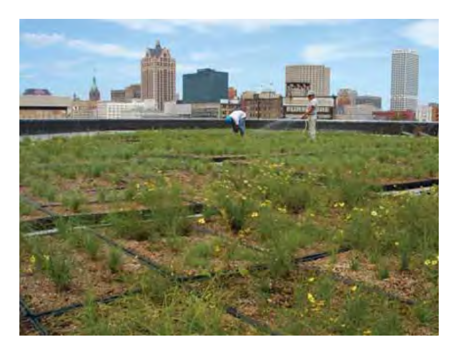
The green roof atop MMSD's headquarters, shown just after installation, demonstrates how stormwater flow into the city's sewer system could be reduced.

One of these is at the Highland Gardens housing project, a 114-unit mid-rise for senior citizens and people with disabilities. A 20,000 square foot green roof was installed at a cost of $380,000. The roof will retain 85% of a two-inch rainfall. The remaining 15% of the water volume is directed to rain gardens and a retention basin used for on-site irrigation.<sup>30</sup> These management strategies prevent stormwater from being discharged to the collection system.