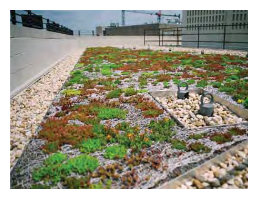
The first commercial high-elevation green roof in Washington, DC, will be monitored to determine how much it lowers air temperature.