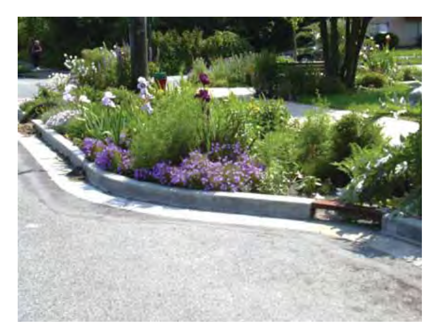
Infiltration bulges capture and infiltrate stormwater before it reaches the collection system.

transportation corridors by making them more pedestrian friendly. The city is extending curbs at intersections out into the street to lessen the crossing distance and improve the line of sight for pedestrians. The city's stormwater catch basins are located at roadway intersections; when the bulges were constructed, the city was initially relocating these catch basins outside of the bulges. Now, in certain instances, the Streets Department is installing permeable soils and vegetation within these bulged sections to introduce green space and collect stormwater. The catch basins are left in place within the bulges and any stormwater that does not infiltrate into the soil overflows into the stormwater system. This new design not only reduces the amount of stormwater runoff, but is also less costly for the city. Because the stormwater infiltration bulges are installed in conjunction with planned roadway improvements, the only additional costs associated with the stormwater project are the costs of a steel curb insert to allow stormwater to enter the bulge and additional soil excavation costs. These additional costs are more than offset by the $2,400 to $4,000 cost of relocating the catch basins. To date, the city has installed nine infiltration bulges, three of which are maintained by local volunteers as part of a Green Streets program where local residents adopt city green space.<sup>143</sup>