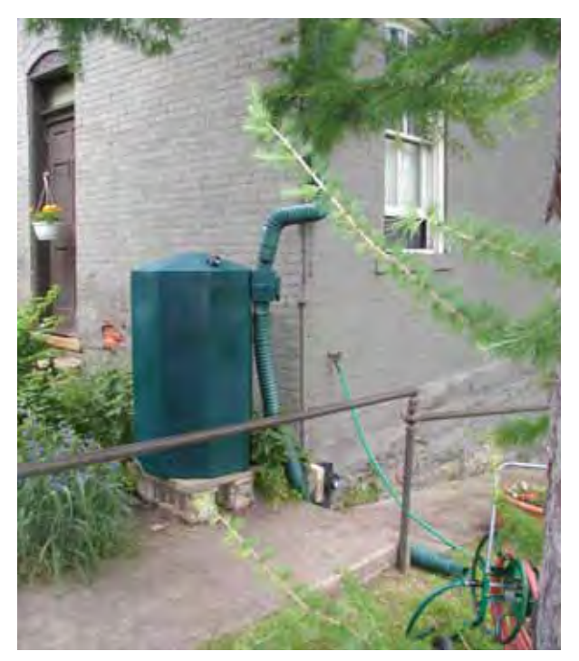
A RiverSafe RainBarrel installed at the Jane Holmes nursing residence in Pittsburgh, PA, by the Nine Mile Run RainBarrel Initiative.

techniques to be installed at numerous locations throughout the city. Green infrastructure is flexible, allowing it to be applied in a wide range of locations and circumstances, and can be tailored to newly developed land or retrofitted to existing developed areas. This enables green infrastructure to be used on individual sites or in individual neighborhoods to address localized stormwater or CSO problems, or incorporated into a more widespread municipal stormwater management program.