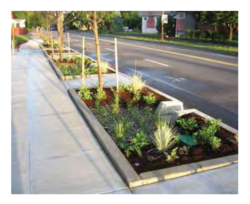
Bioswales on Portland's Division Street infiltrate and treat stormwater runoff.

stormwater sewer systems and combined sewer systems. Separate stormwater sewer systems collect only stormwater and transmit it with little or no treatment to a receiving stream, where stormwater and its pollutants are released into the water. Combined sewer systems collect stormwater in the same set of pipes that are used to collect sewage, sending the mixture to a municipal wastewater treatment plant.