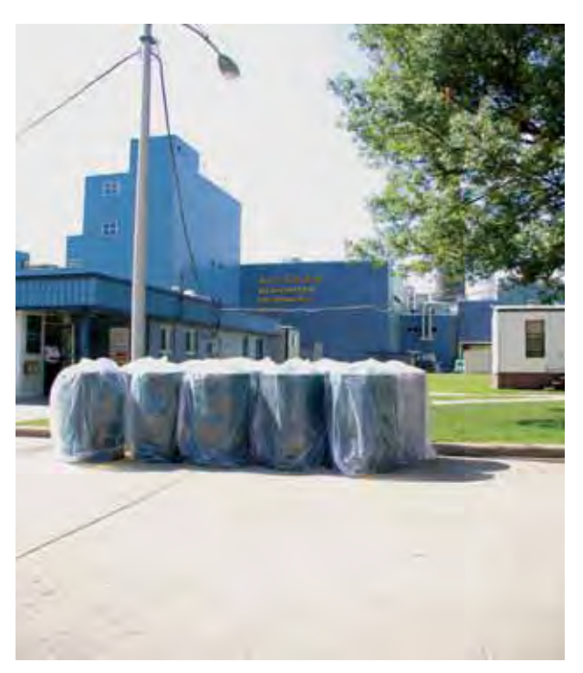
The Nine Mile Run RainBarrel Initiative used 500 RainBarrels to achieve CSO reduction for the ALCOSAN treatment plant in Pittsburgh.

Of course, natural stormwater retention and filtration is provided by Mother Nature for free. The high costs associated with urban stormwater result from the destruction of free, natural stormwater treatment systems-trees, meadows, wetlands, and other forms of soil and vegetation. For example, researchers at the University of California at Davis have estimated that for every 1,000 deciduous trees in California's Central Valley, stormwater runoff is reduced nearly 1 million gallons—a value of almost $7,000.4 Clearly, preserving trees reduces polluted stormwater discharges and the need for engineered controls to replace those lost functions. When those trees are cut down and their functions are lost, those costs are passed on to municipal governments, which then pass them on to their citizens. So, while the bulk of this report is about how to integrate green infrastructure into the