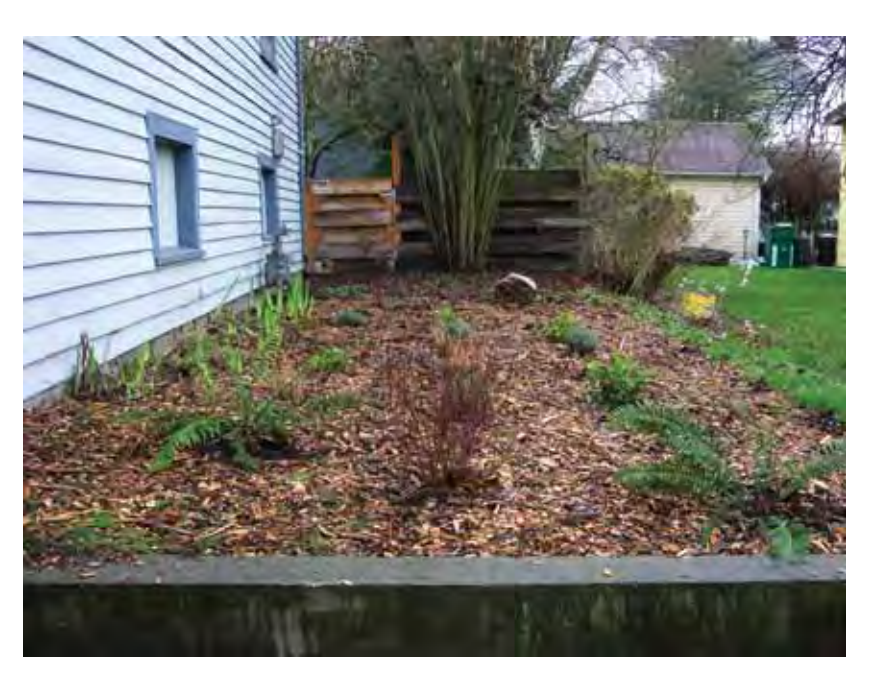
This private residence in Seattle, WA, incorporates stormwater controls and vegetative gardens.