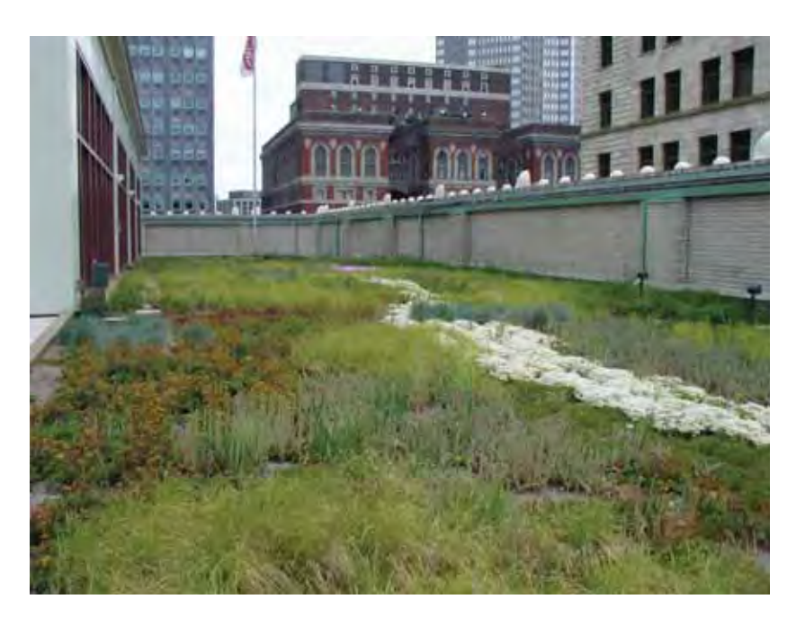
The green roof surrounding the executive offices on the Heinz 57 Center in Pittsburgh not only provides environmental benefits, but also creates green space for outdoor meetings and employee enjoyment 14 stories above the ground.

exacerbated by the fragmented nature of the collection and treatment system. While there is one treatment plant operated by the Allegheny County Sanitary Authority (ALCOSAN) in the metro area, there are 83 separate municipalities, each responsible for maintaining their own collection system. Many pipes are in a state of disrepair, and ALCOSAN estimates that repairing the system using traditional sewage infrastructure strategies will cost more than $3 billion. This investment includes an expansion of the wastewater treatment plant capacity over the next 20 years from 225 million gallons per day (mgd) to 875 mgd to reduce CSOs. However, 565 mgd of this increased capacity would only provide primary treatment.<sup>41</sup>